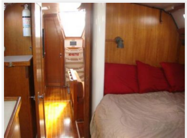
42' Catalina master stateroom aft