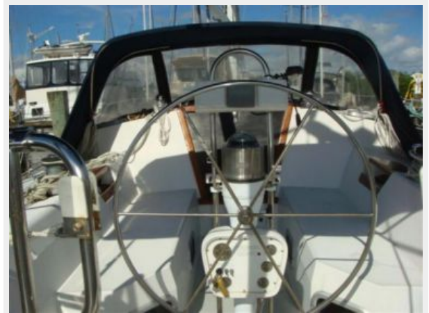
42' Catalina cockpit forward