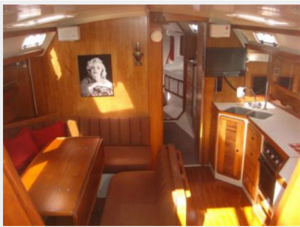
42' Catalina salon forward