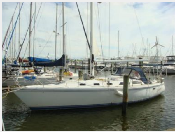
42' Catalina port forward profile