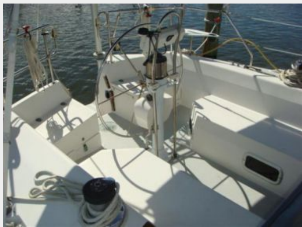
42' Catalina cockpit