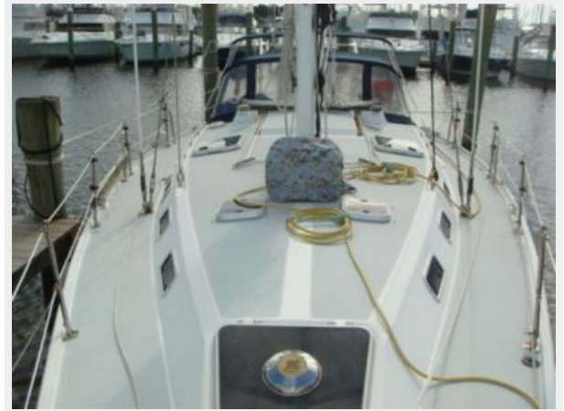
42' Catalina foredeck aft