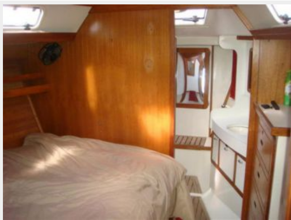
42' Catalina master stateroom forward