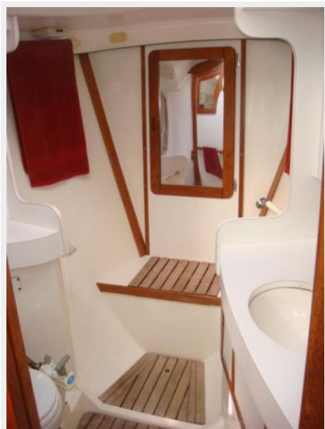
42' Catalina master stateroom head