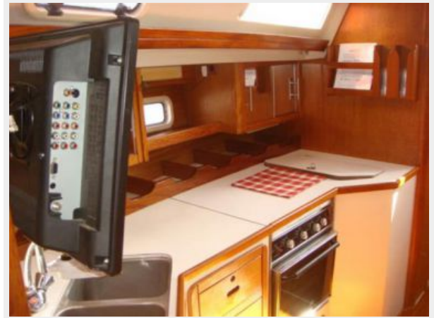
42' Catalina galley photo2