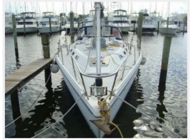
42' Catalina forward profile