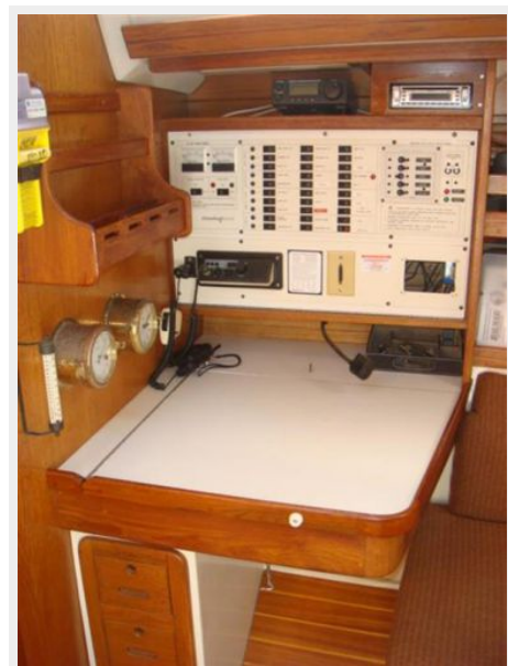
42' Catalina nav station