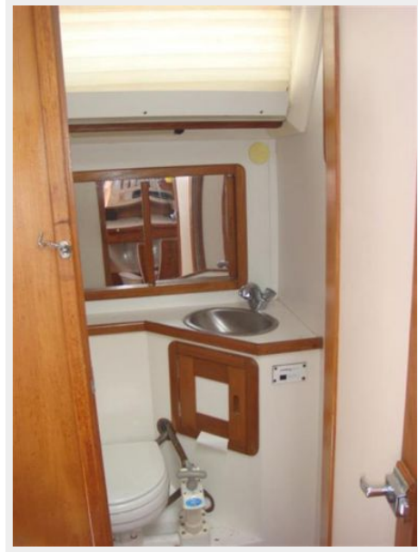
42' Catalina guest head