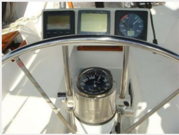
42' Catalina cockpit helm