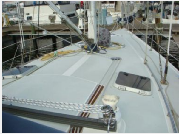
42' Catalina foredeck