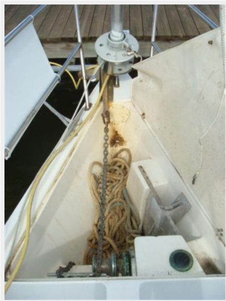
42' Catalina anchor windlass