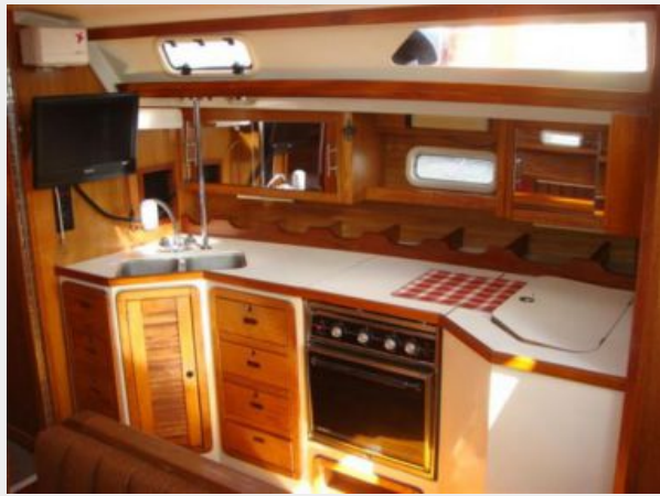
42' Catalina galley photo1