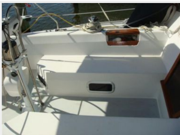
42' Catalina cockpit port