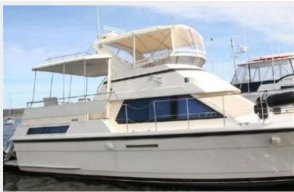
Facing aft from the bow