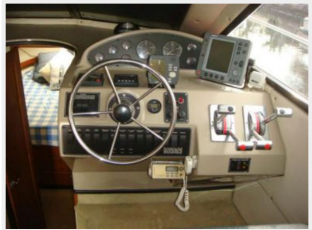
37' Bayliner lower helm photo2