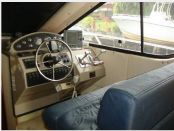
37' Bayliner lower helm photo1