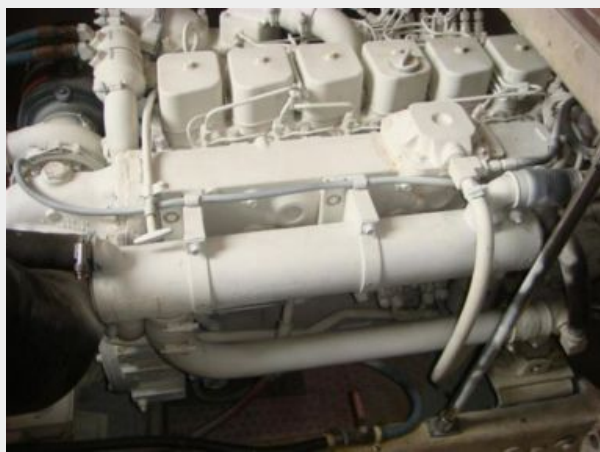
37' Bayliner port main engine