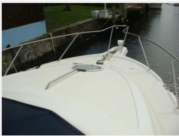
37' Bayliner foredeck