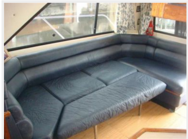
37' Bayliner salon starboard seating photo1