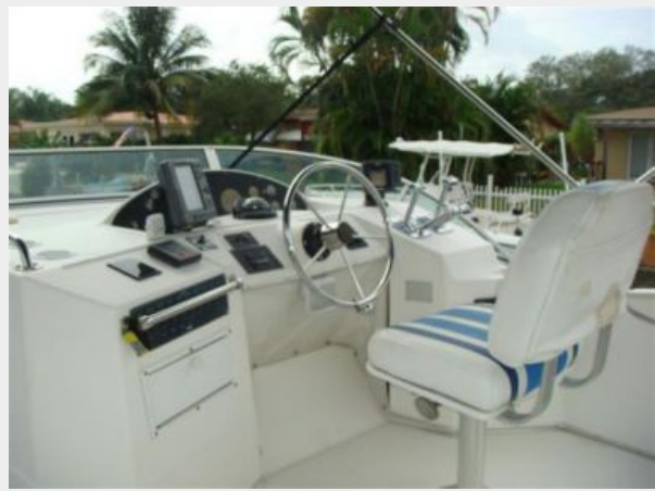
37' Bayliner flybridge forward