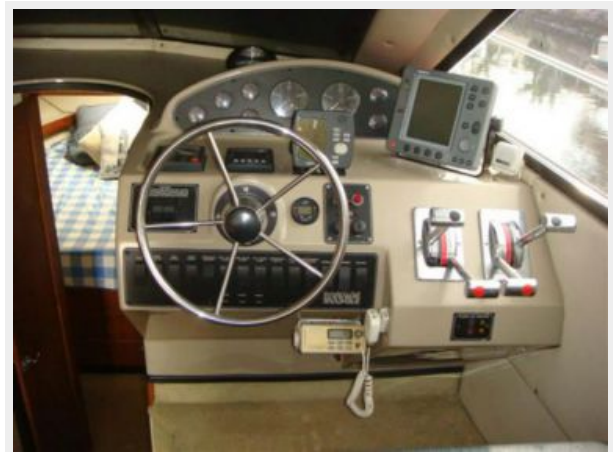
37' Bayliner lower helm photo2