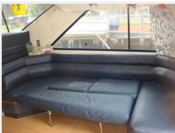
37' Bayliner salon starboard seating photo2