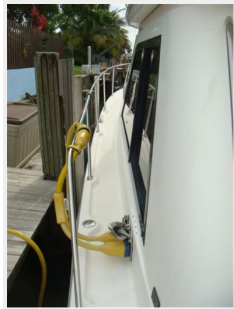
37' Bayliner port side deck photo2