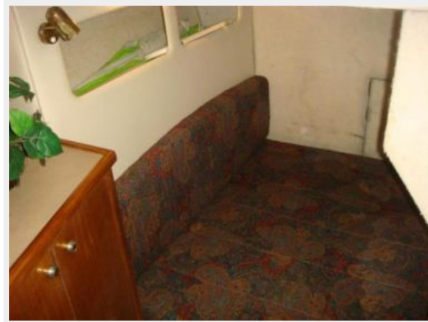
37' Bayliner guest stateroom