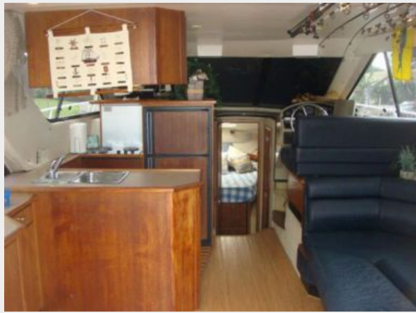
37' Bayliner salon forward