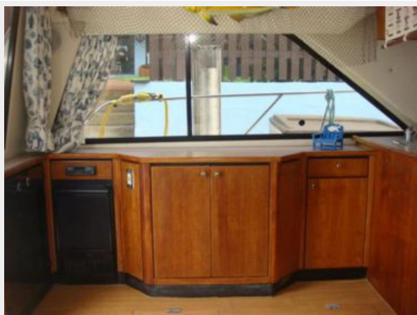
37' Bayliner salon port