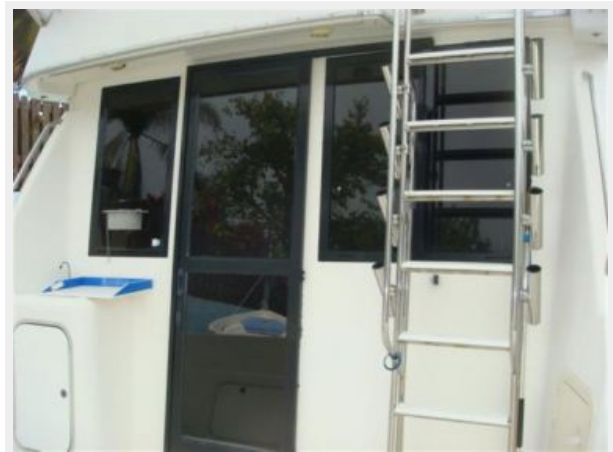
37' Bayliner cockpit forward