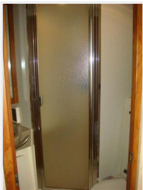
37' Bayliner head