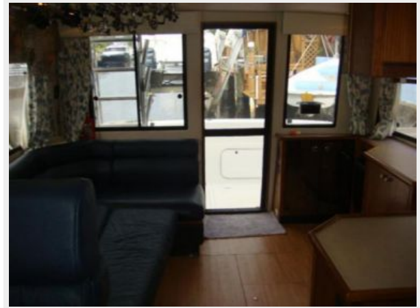
37' Bayliner salon aft