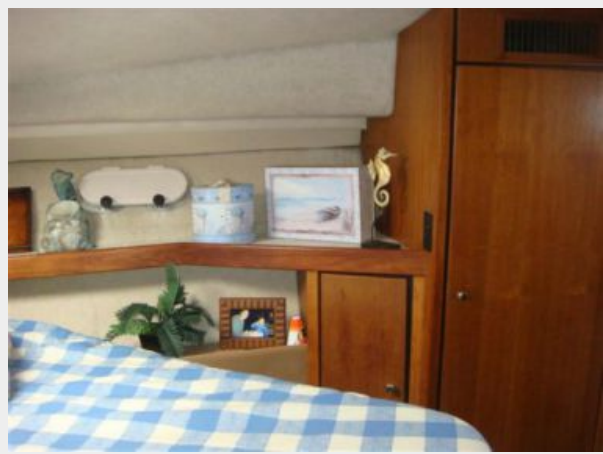
37' Bayliner master stateroom starboard