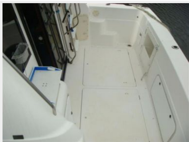
37' Bayliner cockpit