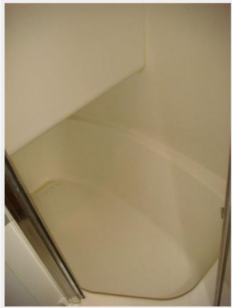
37' Bayliner tub