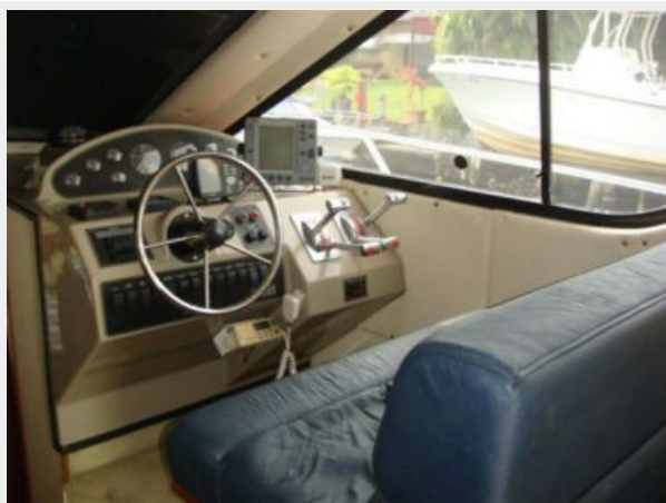
37' Bayliner lower helm photo1