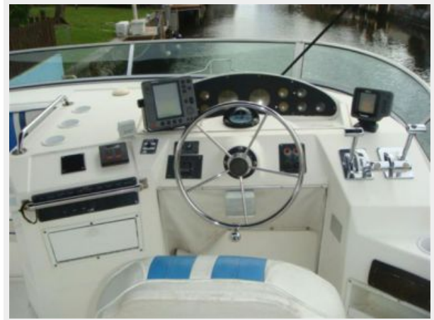
37' Bayliner flybridge helm