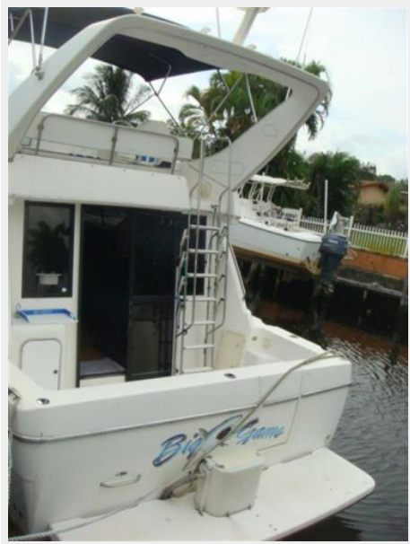
37' Bayliner aft profile