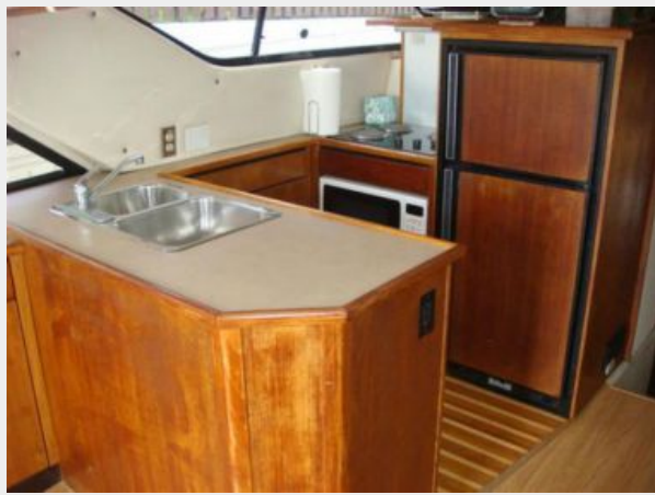
37' Bayliner galley photo1