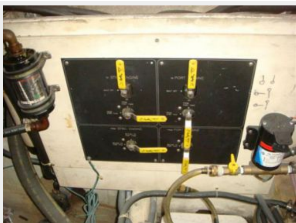
37' Bayliner fuel manifold