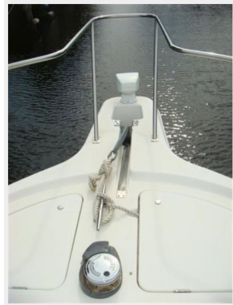
37' Bayliner anchor windlass