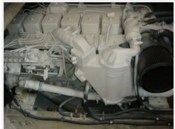
37' Bayliner starboard main engine