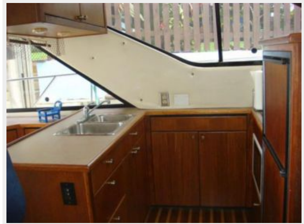
37' Bayliner galley photo2