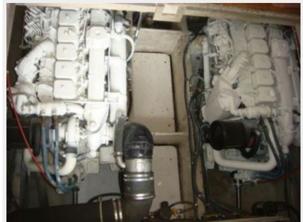
37' Bayliner engine room