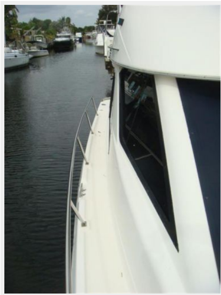
37' Bayliner starboard side deck photo1