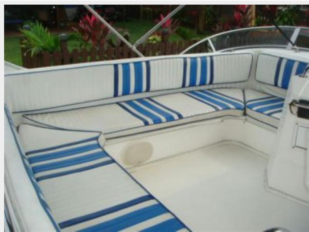
37' Bayliner flybridge seating