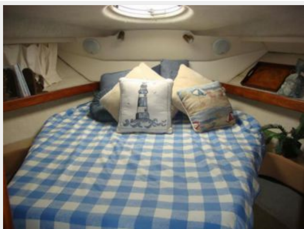
37' Bayliner master stateroom