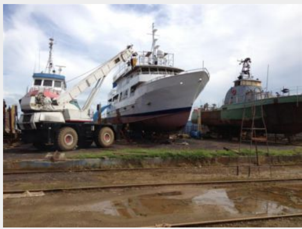
New Mast Being Installed