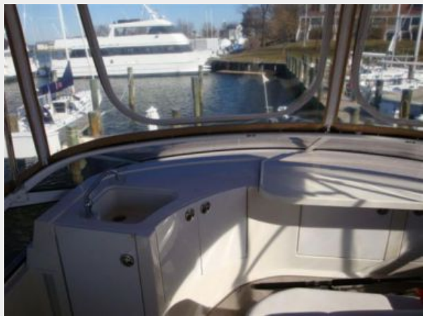
38' Carver flybridge forward