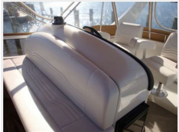
38' Carver flybridge forward seating