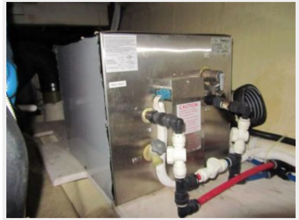
38' Carver water heater