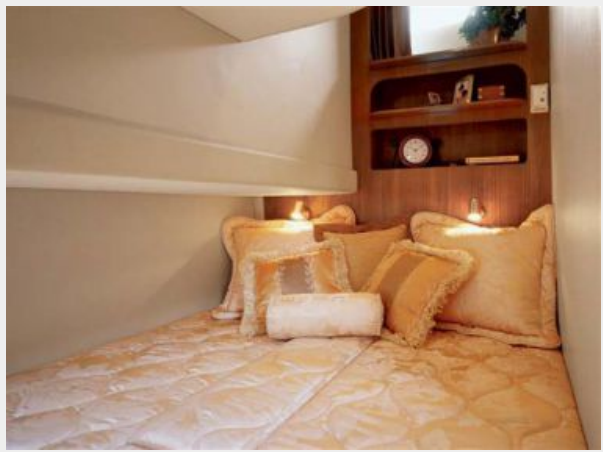
38' Carver guest stateroom photo2