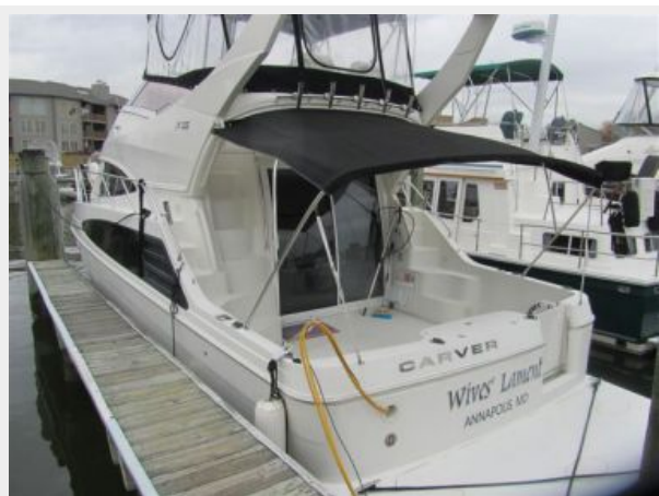
38' Carver port aft profile