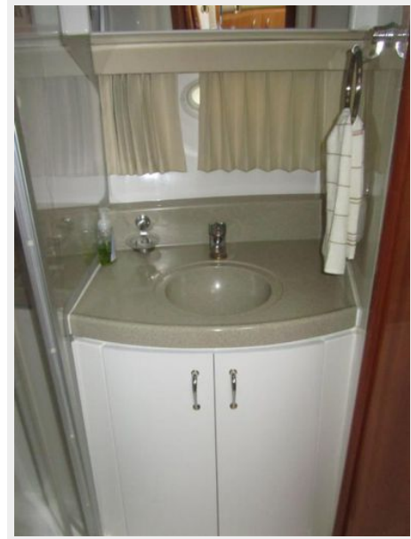
38' Carver head