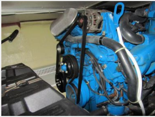
38' Carver starboard main engine