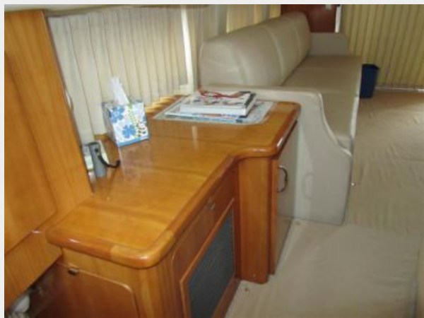
38' Carver salon starboard aft