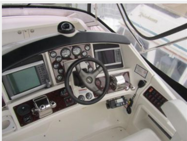
38' Carver flybridge helm