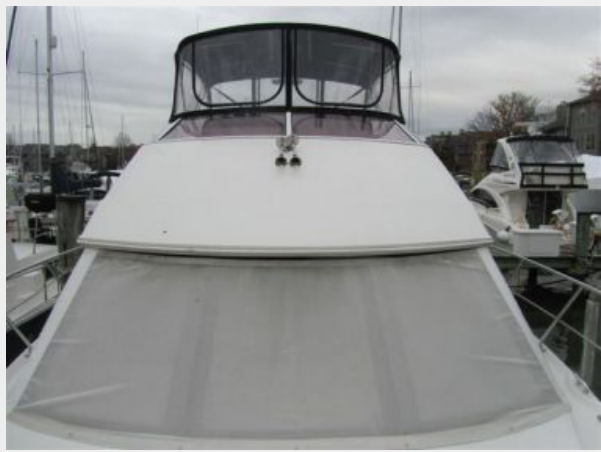
38' Carver foredeck aft