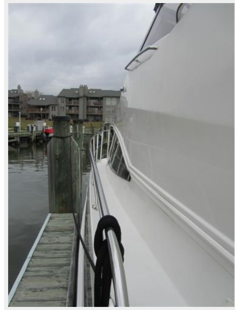
38' Carver port side deck