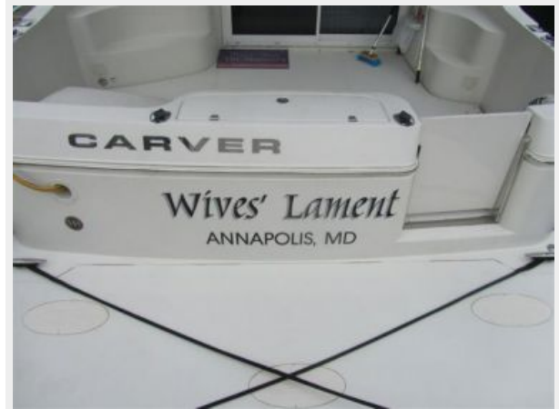
38' Carver swimplatform