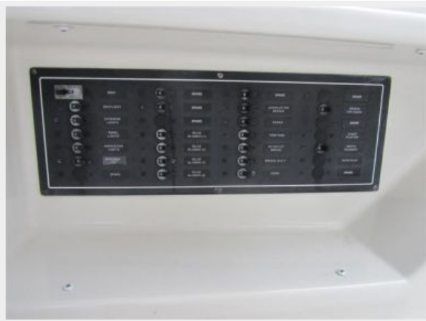
38' Carver electrical panel