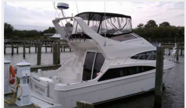
38' Carver starboard aft profile