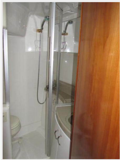
38' Carver shower