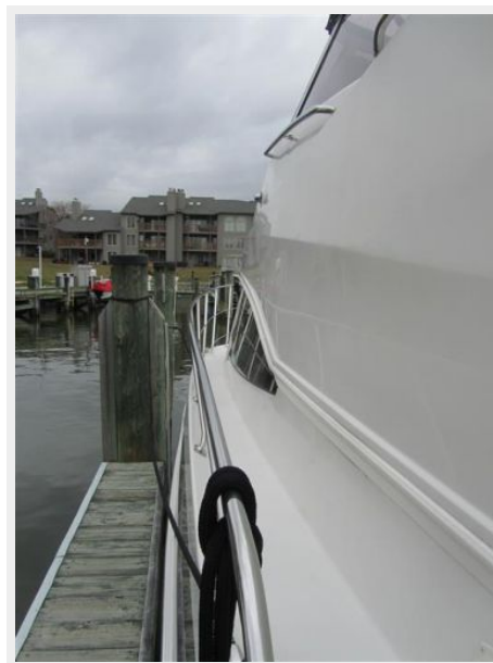
38' Carver port side deck