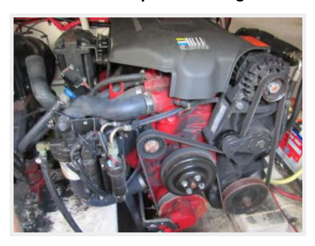
28' Cruisers port main engine