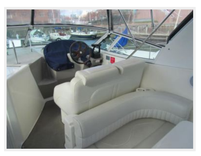
28' Cruisers upper deck starboard forward