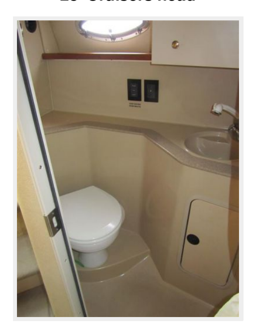
28' Cruisers head