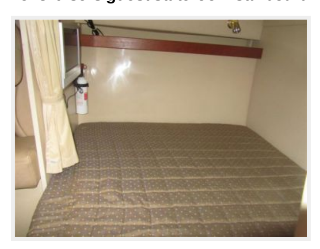
28' Cruisers guest stateroom starboard