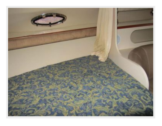
28' Cruisers master stateroom aft