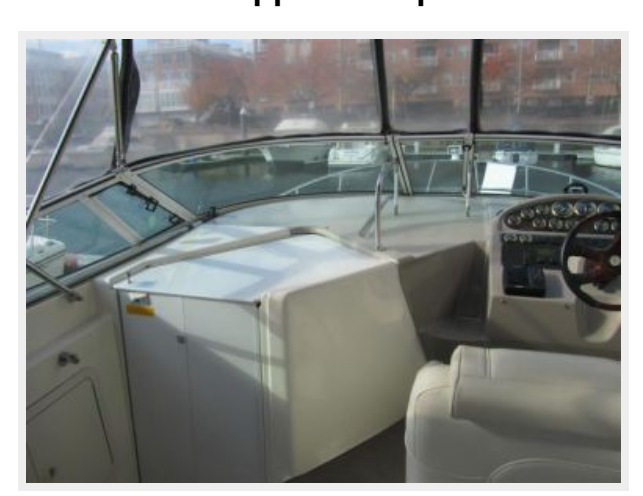
28' Cruisers upper deck port forward