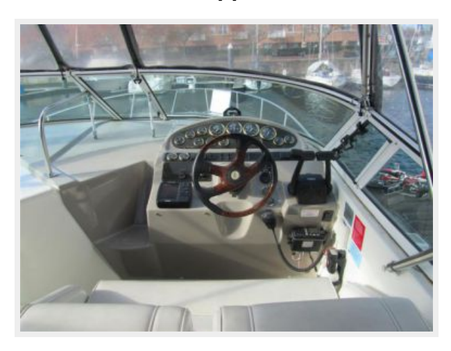
28' Cruisers upper deck helm