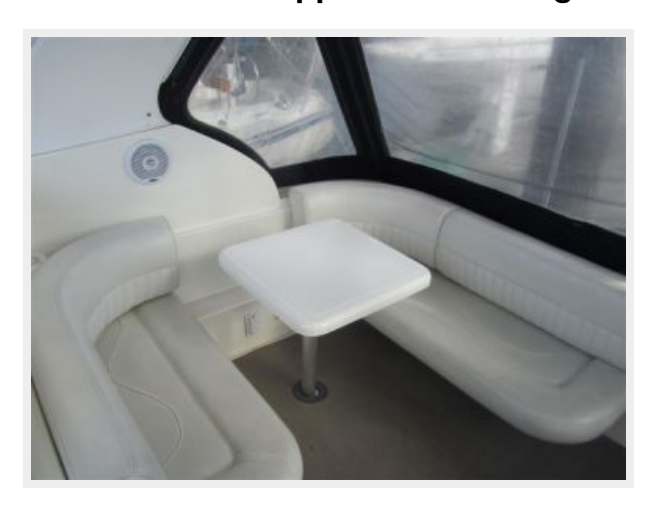
28' Cruisers upper deck seating