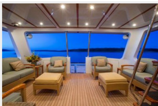
Aft deck looking aft