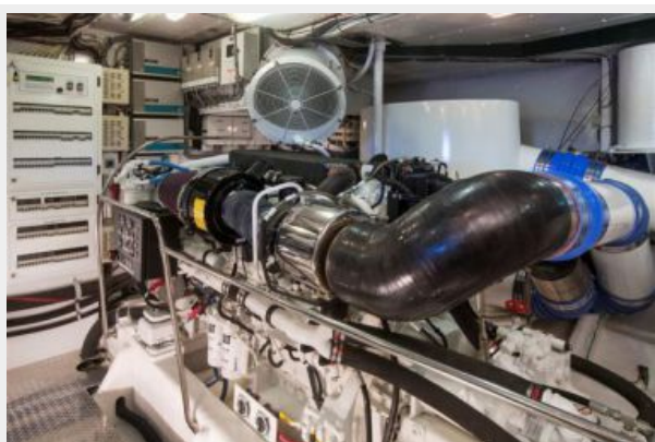
Engine room 2