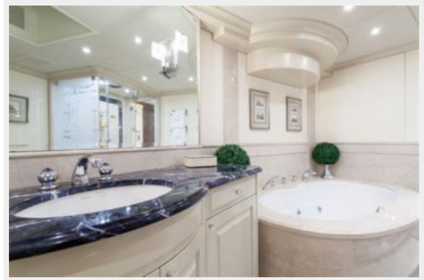
Master Hers Bath