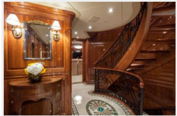
Foyer Main Deck