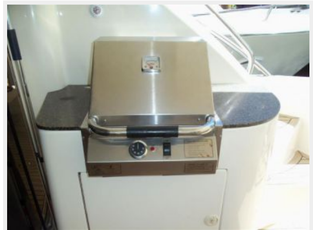
Custom Aft Deck S/S Grill