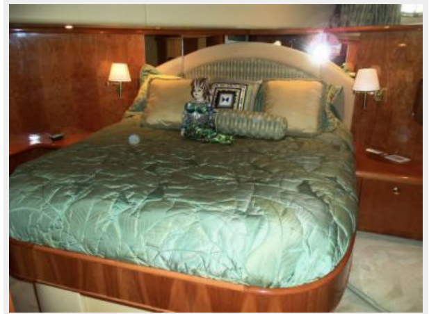
Master Looking Aft