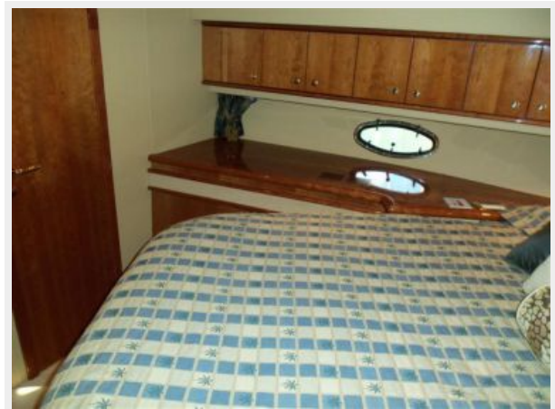
VIP Looking to Port