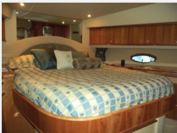
VIP Looking Forward