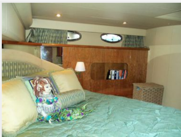
Master Looking to Port