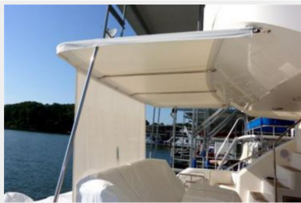
Custom Aft Deck Sunshade