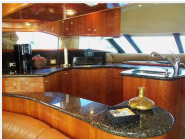
Galley Looking Forward