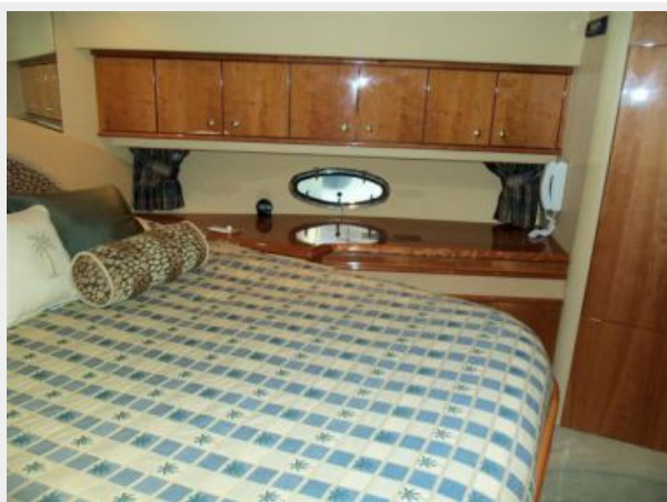
VIP Looking to Starboard