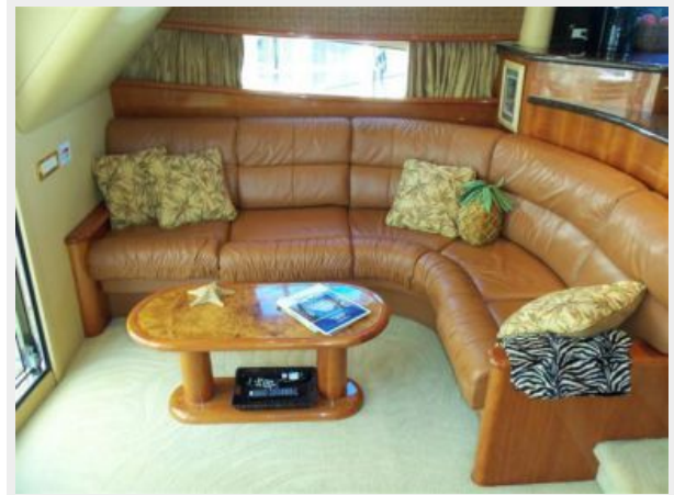
Salon Looking to Port