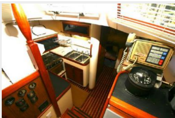
Down into Galley