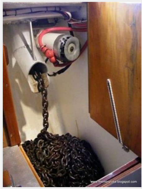
Custom Chain Locker