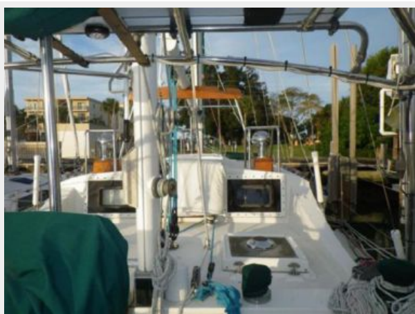
View from Cockpit