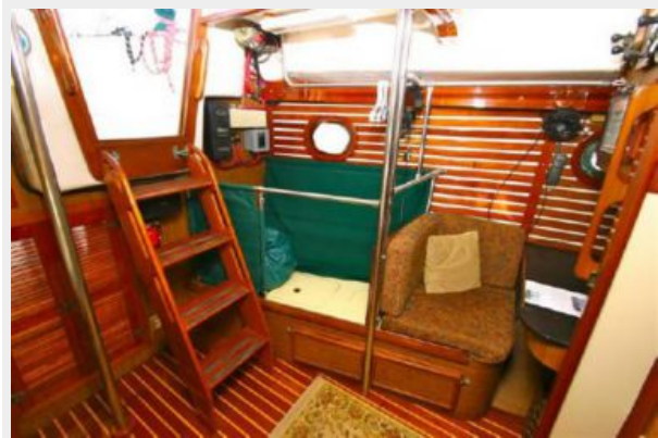
Master to Port