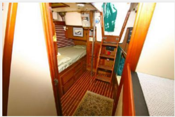
Master to Aft