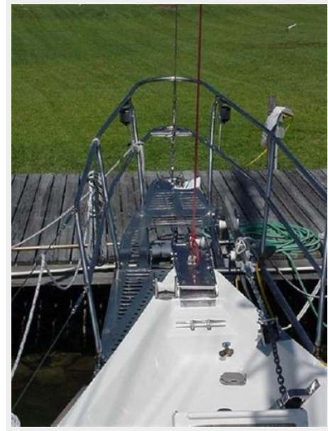
Custom Bow Sprit