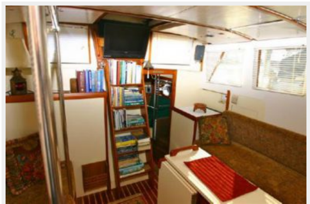
Salon to Aft