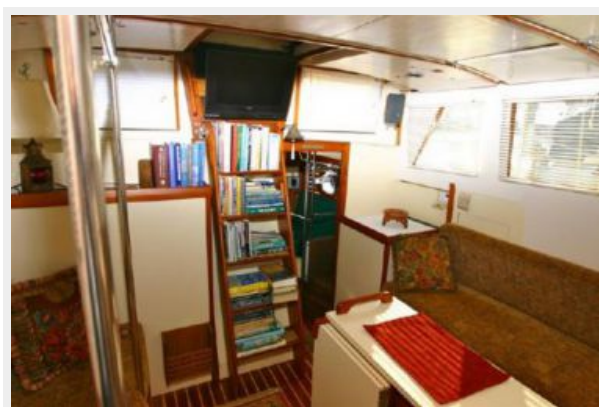
Salon to Aft