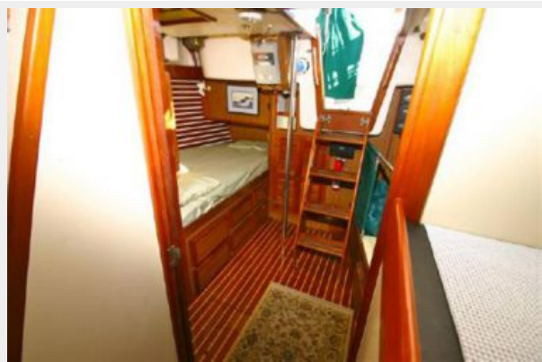
Master to Aft