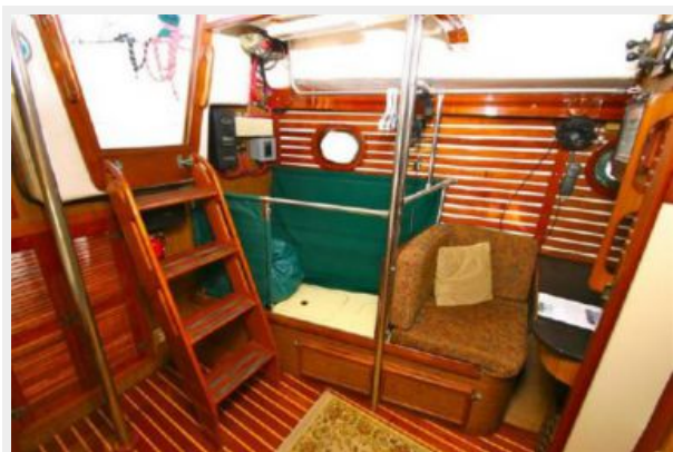
Master to Port