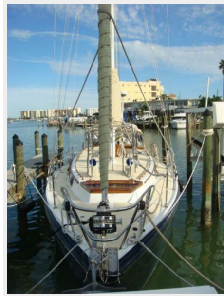
45' Coronado forward profile