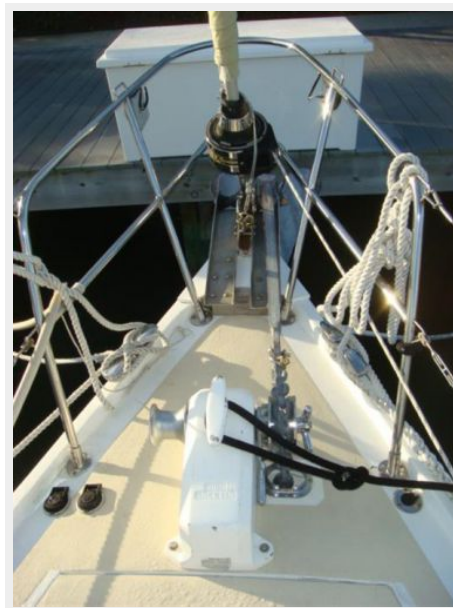
45' Coronado anchor windlass