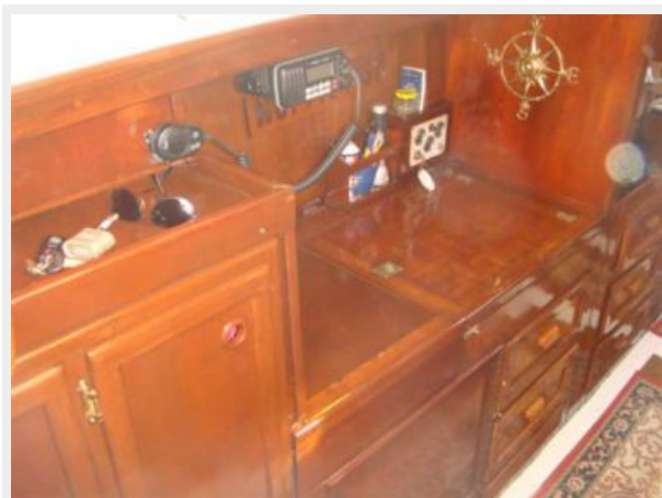
45' Coronado salon port aft photo1