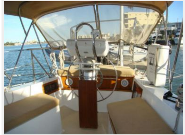
45' Coronado cockpit aft