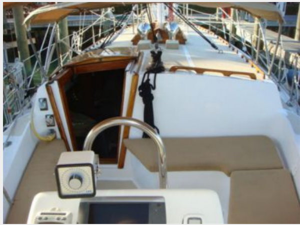
45' Coronado cockpit forward