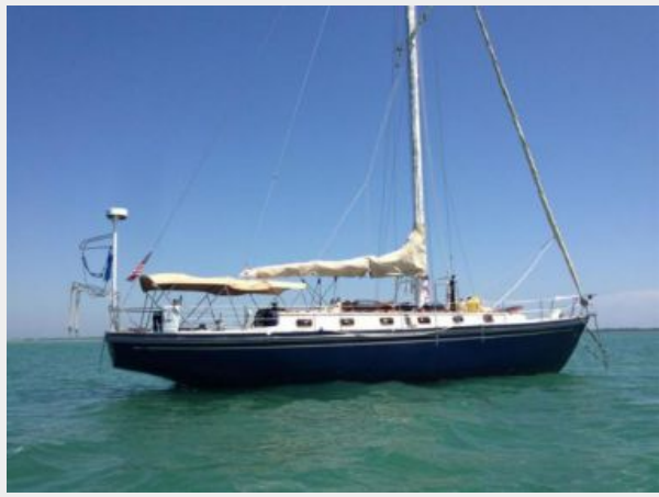
45' Coronado starboard profile