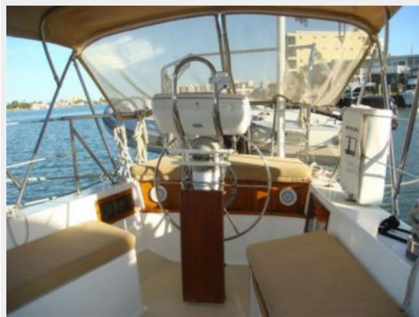
45' Coronado cockpit aft