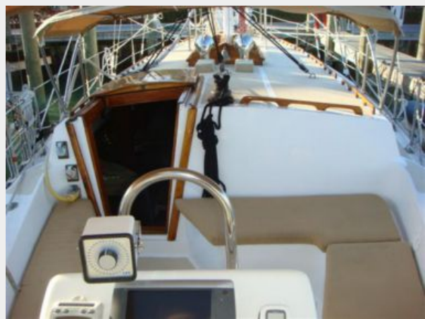
45' Coronado cockpit forward