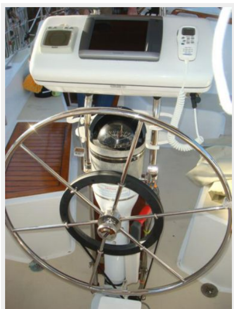
45' Coronado cockpit helm