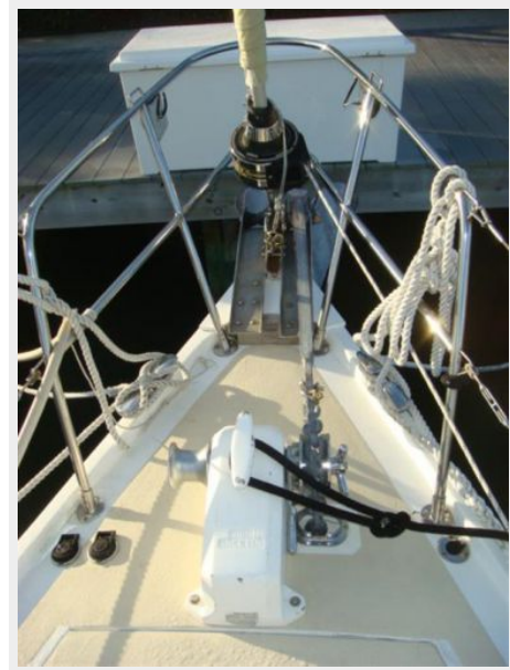
45' Coronado anchor windlass