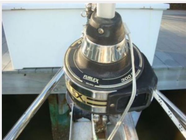
45' Coronado headsail roller furler