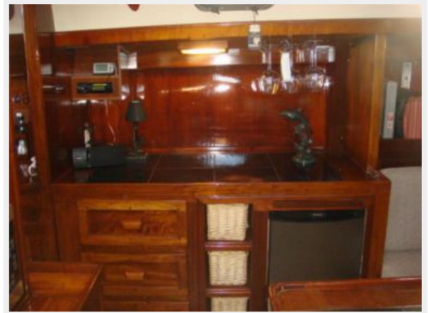
45' Coronado galley port