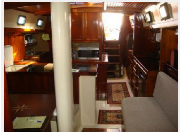
45' Coronado salon settee photo2