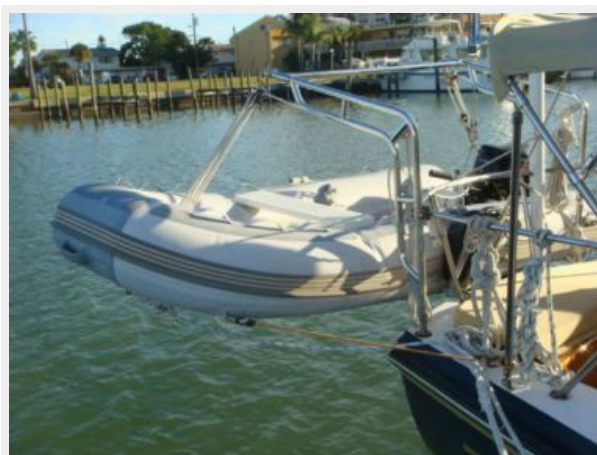
45' Coronado tender