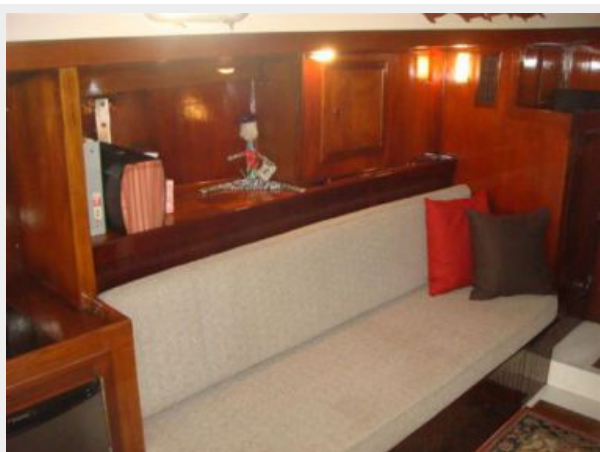
45' Coronado salon port seating