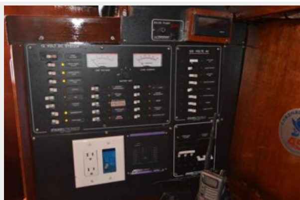
45' Coronado electrical panel