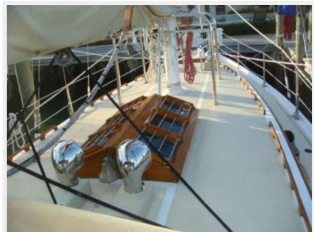
45' Coronado foredeck