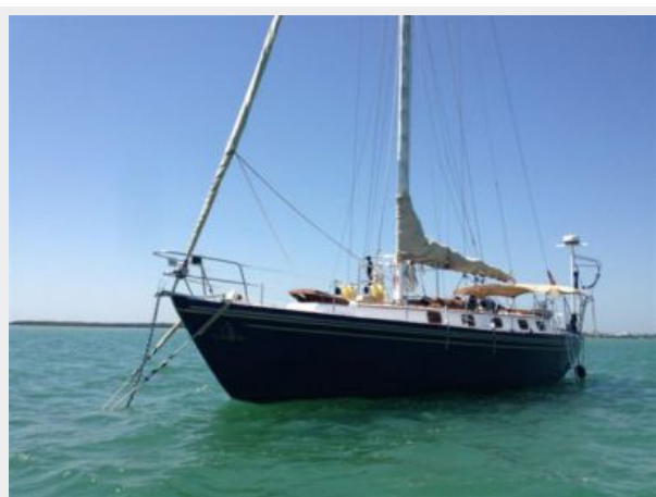
45' Coronado port forward profile