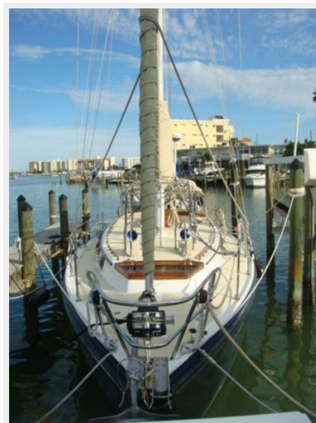
45' Coronado forward profile