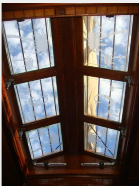
45' Coronado salon overhead deck hatch