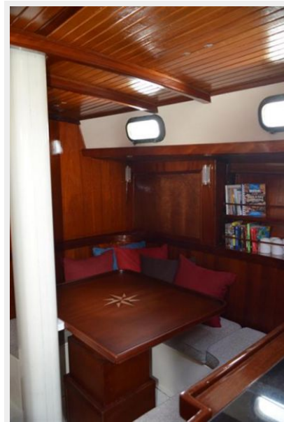
45' Coronado salon settee photo2