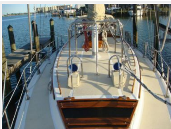
45' Coronado foredeck aft