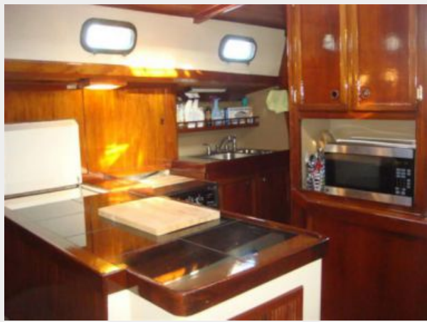
45' Coronado galley photo2