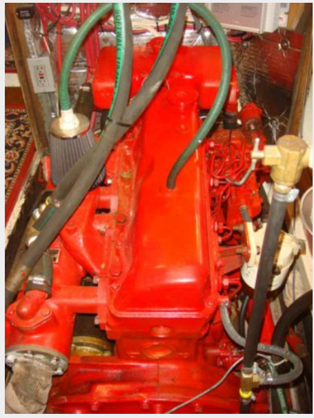
45' Coronado auxilliary photo2