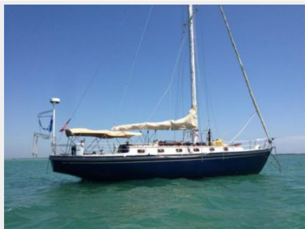
45' Coronado starboard profile