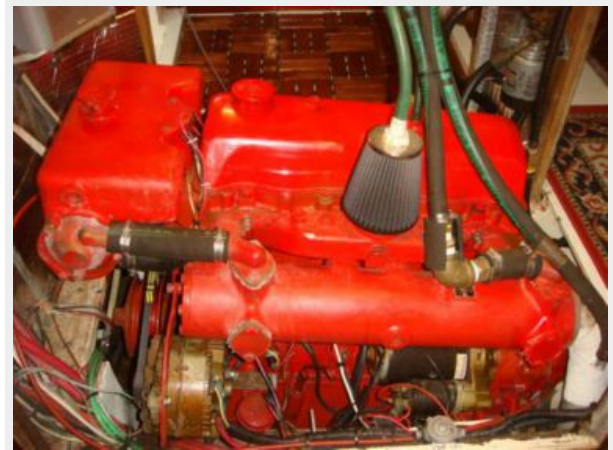
45' Coronado auxilliary photo3