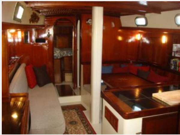
45' Coronado salon forward