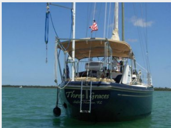
45' Coronado aft profile