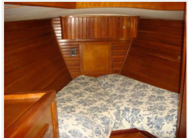
45' Coronado guest stateroom