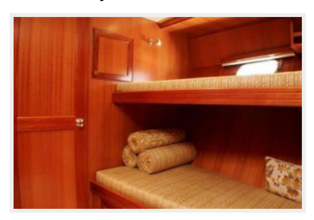
Guest/Dayroom Conversion Bunk