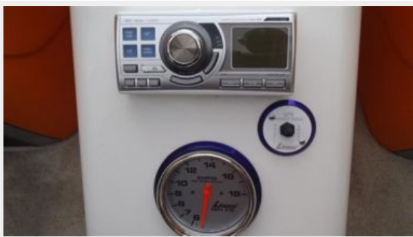
Rear Seat Console