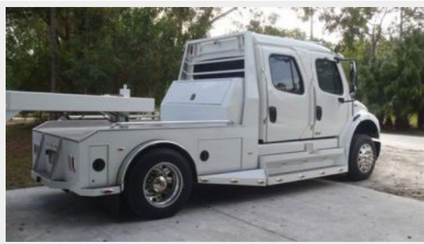
2009 Freightliner Sport Chasis