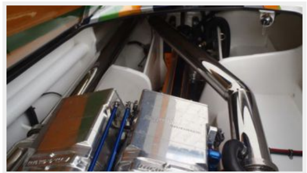
Starboard Engine Aft