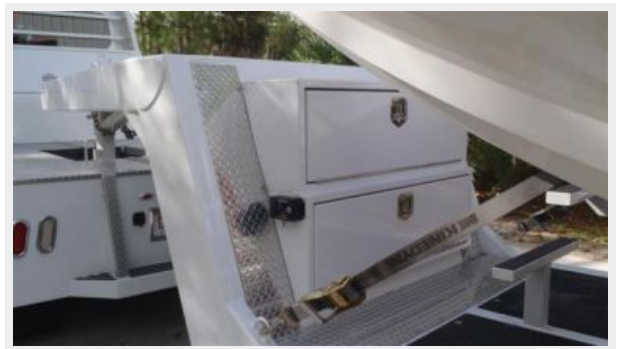
Built-in Tool Boxes on Trailer