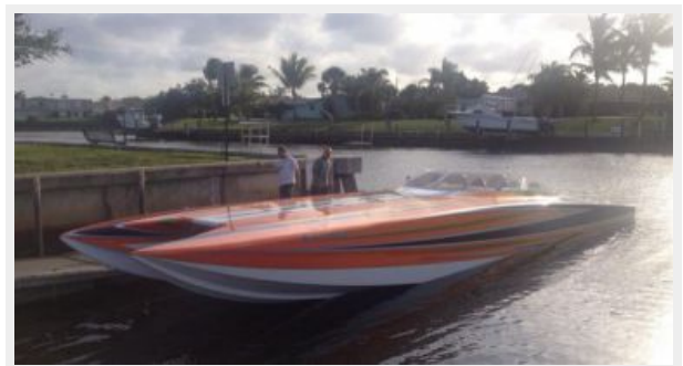
Profile at Dock