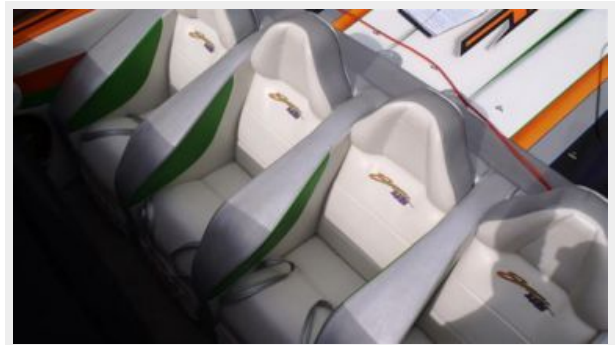
Four Passenger Back Seat