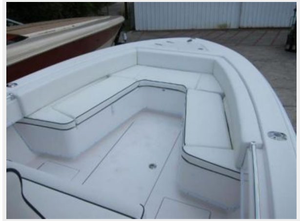
Insulated Fish Box