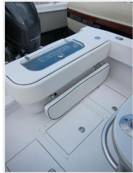
Livewell, Twin 200 Yamaha Four Strokes