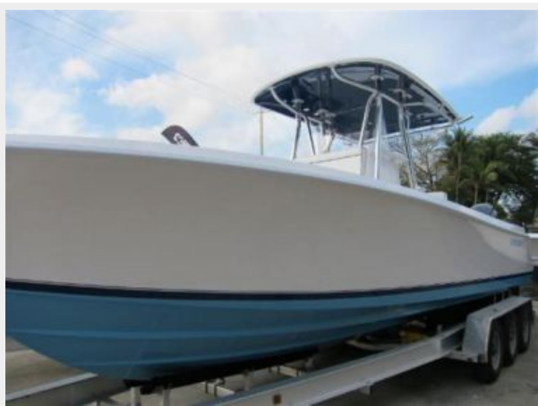
Sky Blue bottom, Aristo blue boot stripe