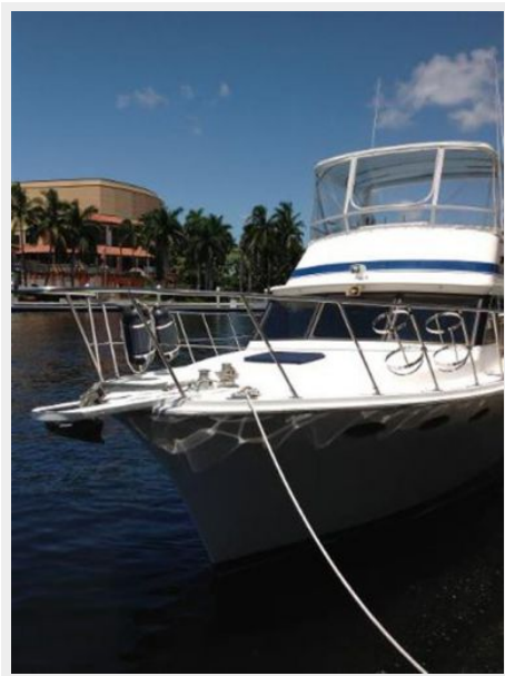
port bow II