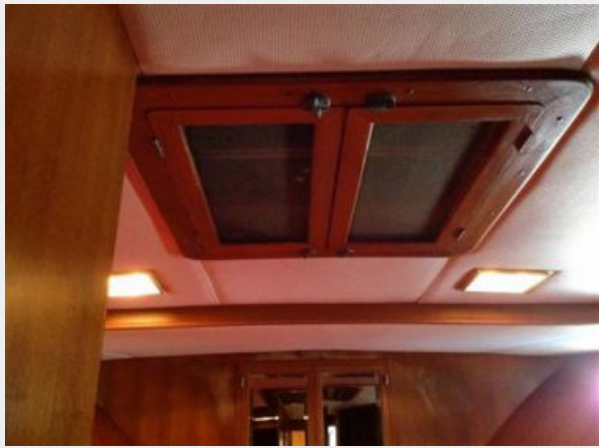
Fwd cabin hatch