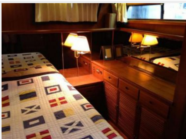
Port side Master Cabin