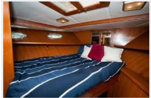
Not actual boat. Same layout