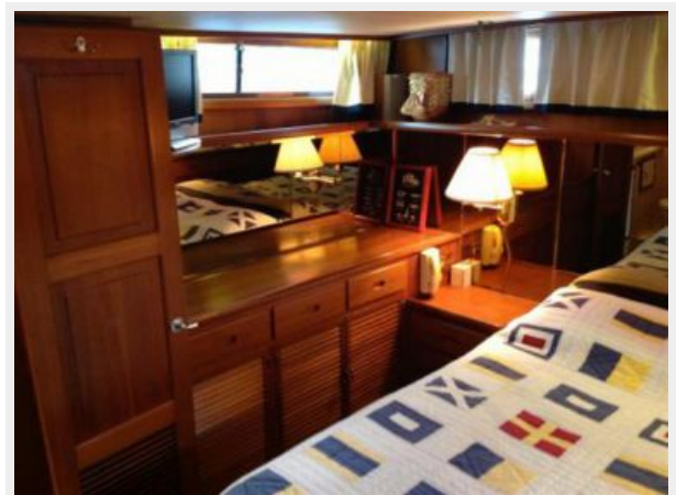
Stbd side Master Cabin