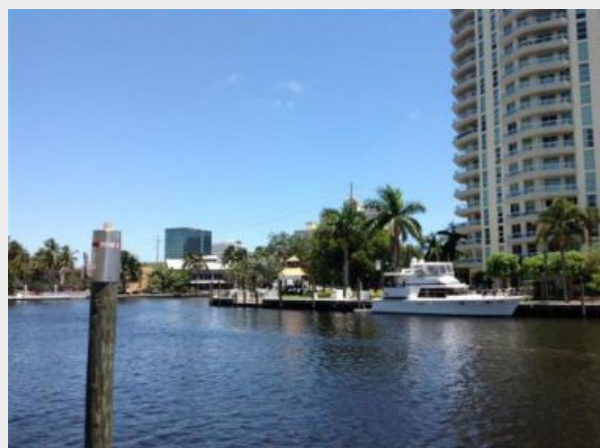
Amerigo on the New River