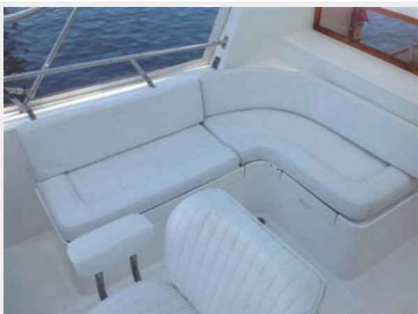
Stbd side Settee Fly Bridge