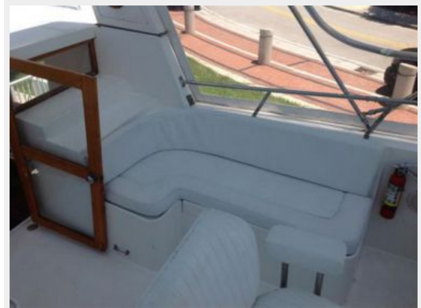
Port side settee Fly Bridge