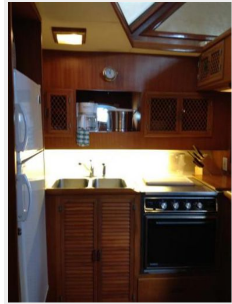
Spice cupboard and countertop