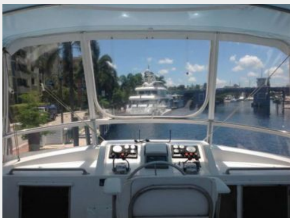
Fly bridge helm