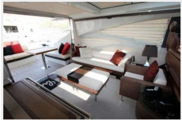
Port Side Salon