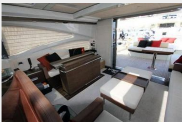
Starboard Side Salon