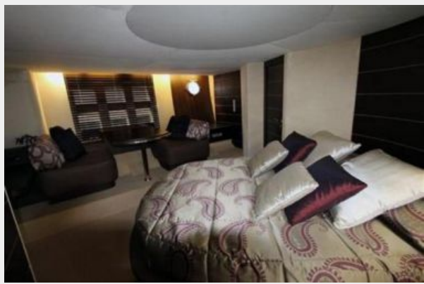
Maser Stateroom 2