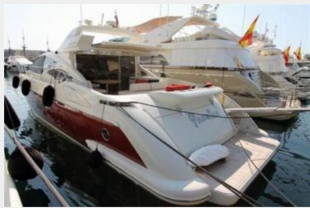
Aft Port Side