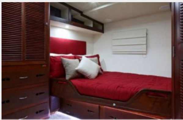
Guest Cabin 1