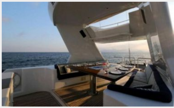
Outside Dining 2