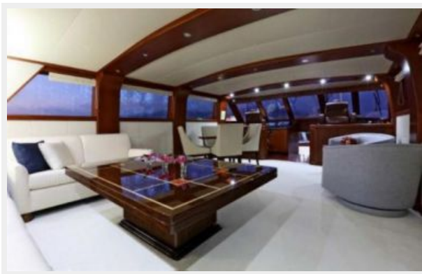
Salon Looking Forward Toward Wheelhouse