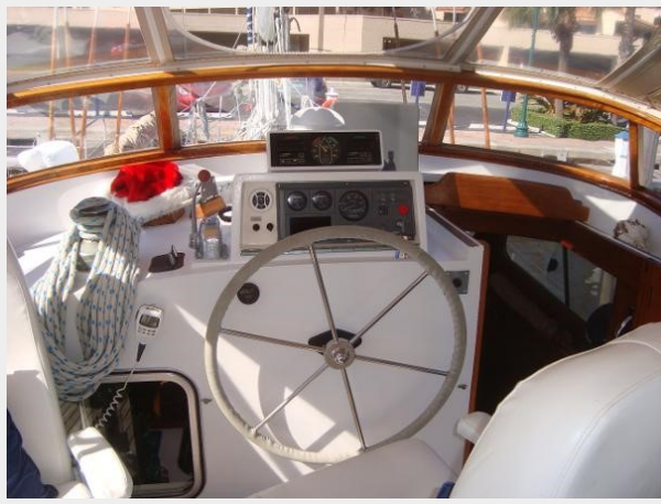
Helm - 2