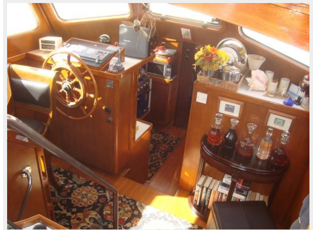
Pilot House - Salon