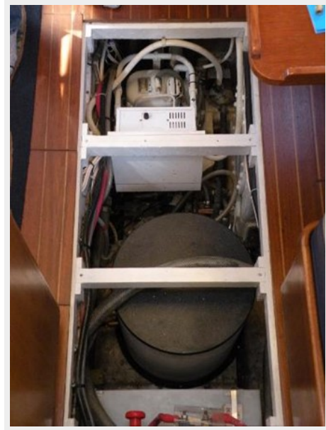
Hot water tank - AC compressor - Below Salon Sole