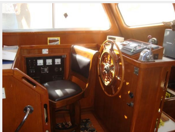
Inside Helm Station