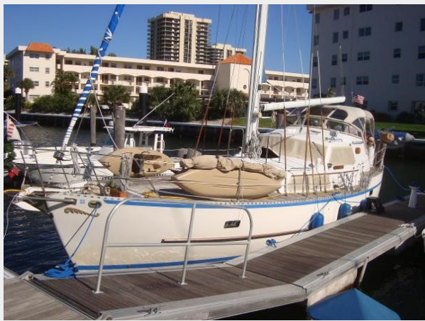
At the Dock