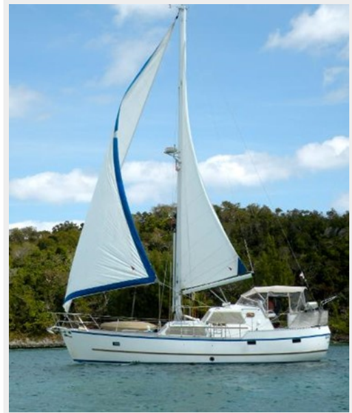
Under sail - 2