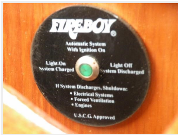
Fire Boy system control