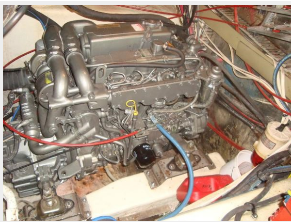
Yanmar Engine -Below Pilot House