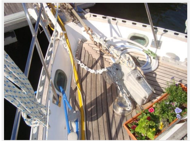
Forward Deck - Windlass