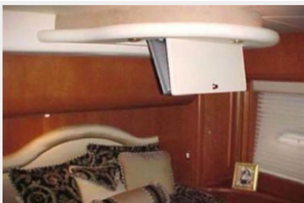
Master Stateroom / Flat Screen Fold Down