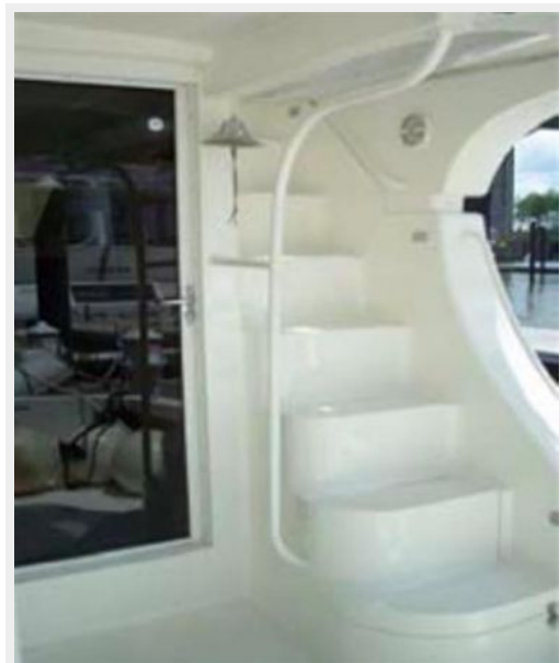
Stairs to FlyBridge