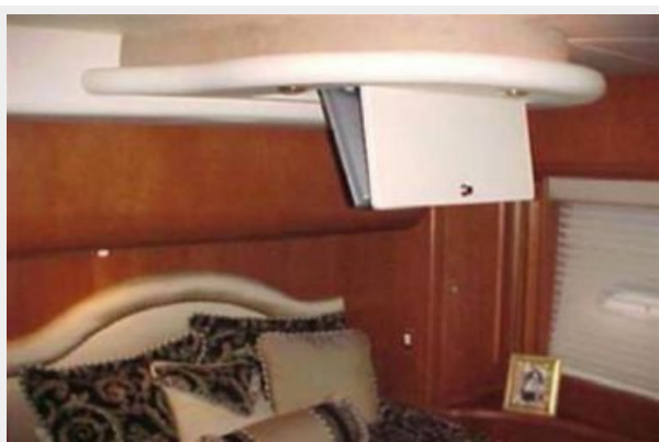
Master Stateroom / Flat Screen Fold Down