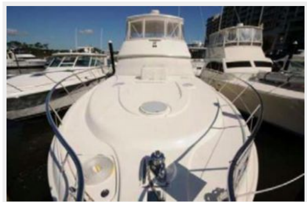
Bow - Looking aft