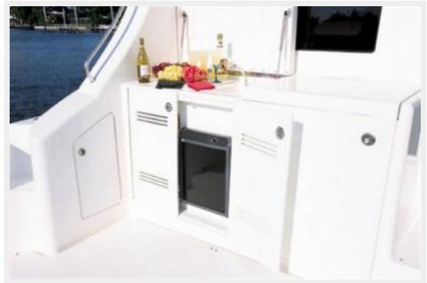
Manufacturer Provided Image: Wetbar