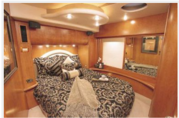
Manufacturer Provided Image: Master Stateroom