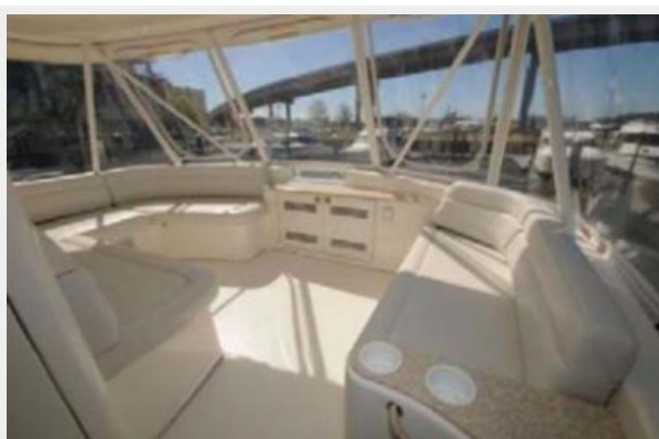
FlyBridge Forward Seating