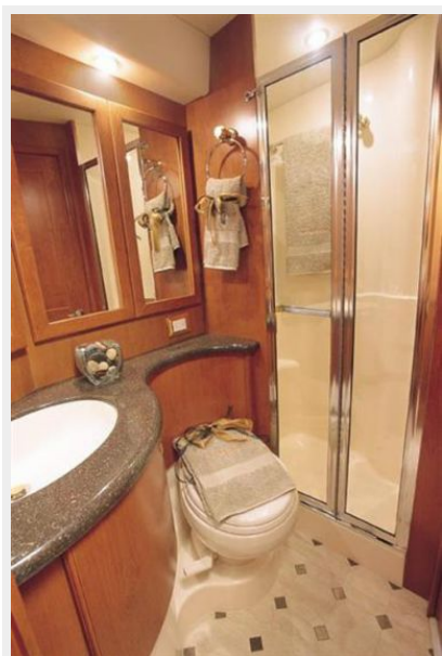
Guest Stateroom