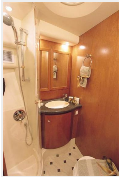
Head