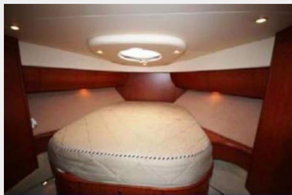
Forward VIP Stateroom