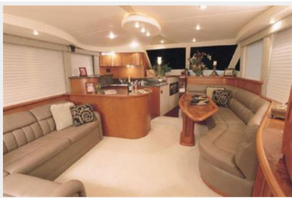
Manufacturer Provided Image: Salon