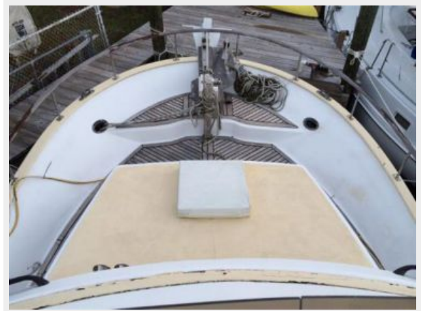
Bow from Flybridge