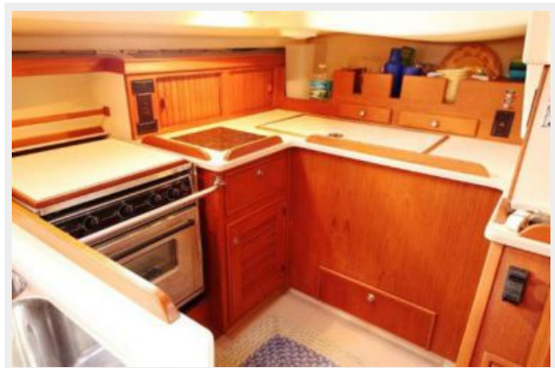
Island Packet 420 Galley