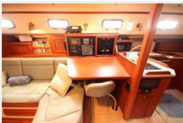
Island Packet 420 Chart Table