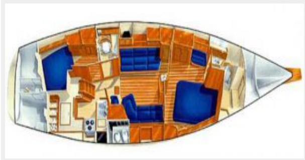
Island Packet 420 Layout