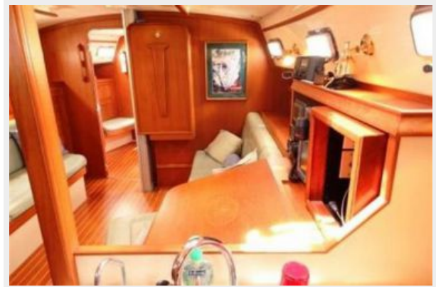
Island Packet 420 Main Salon looking Forward