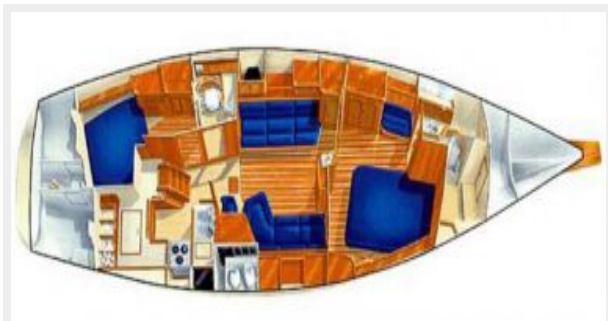
Island Packet 420 Layout