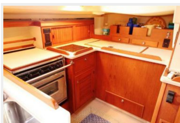
Island Packet 420 Galley