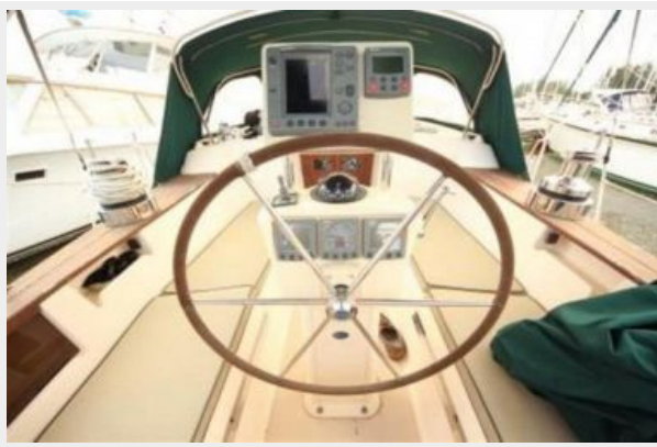
Island Packet 420 Helm