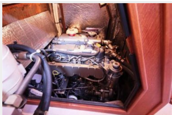
Island Packet 420 Engine Starboard Side