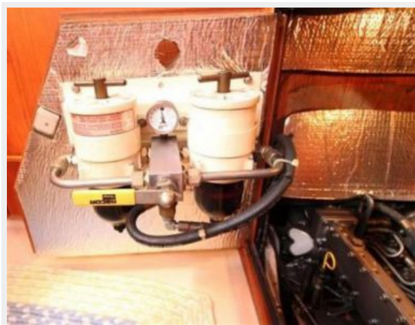
Island Packet 420 Fuel Filters