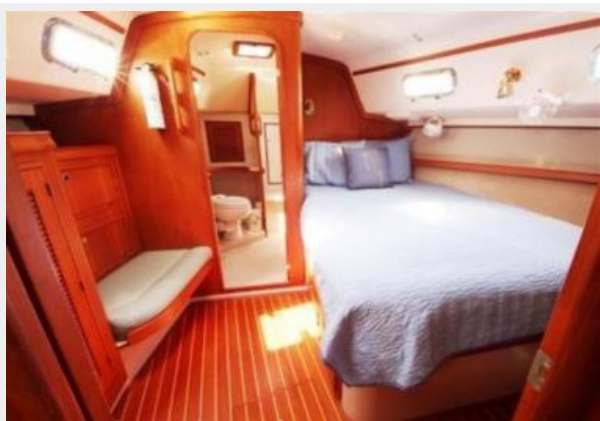
Island Packet 420 Owner's Stateroom