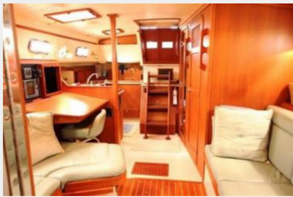
Island Packet 420 Main Salon looking