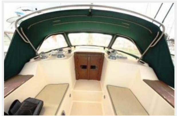
Island Packet 420 Cockpit