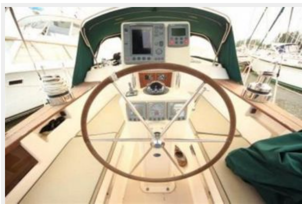
Island Packet 420 Helm