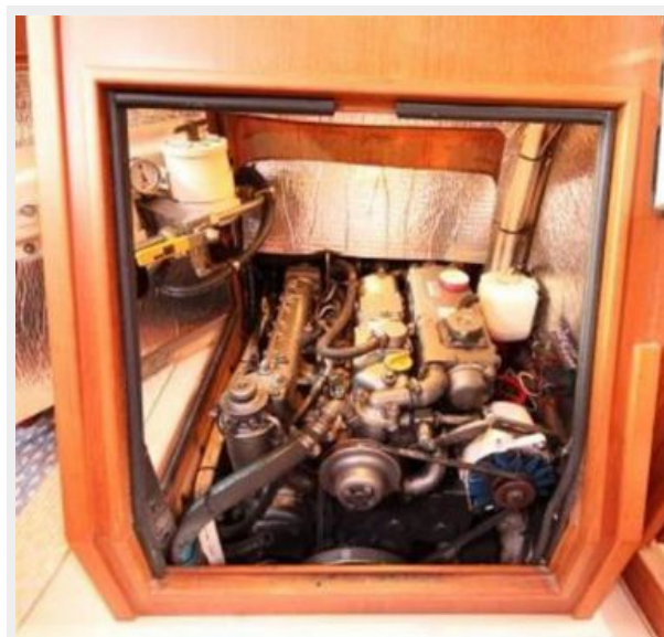
Island Packet 420 Engine