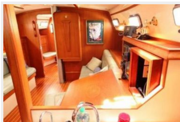
Island Packet 420 Main Salon looking Forward