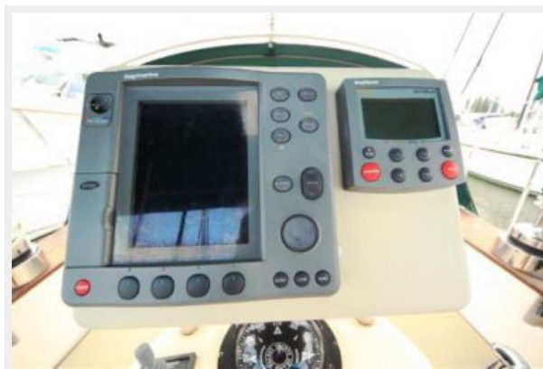
Island Packet 420 Nav Instruments