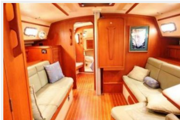
Island Packet 420 Main Salon