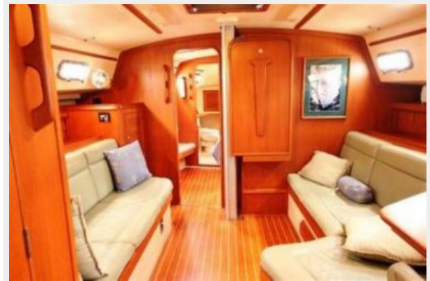
Island Packet 420 Main Salon