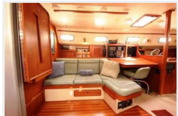
Island Packet 420 Main Salon Starboard