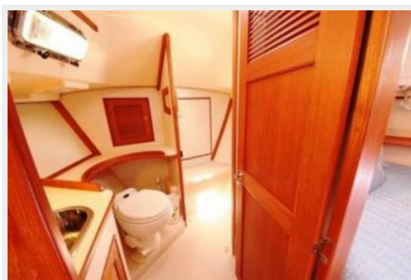
Island Packet 420 Owner's Head w/shower