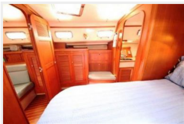
Island Packet Owner's Stateroom Port