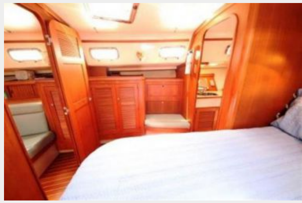
Island Packet Owner's Stateroom Port