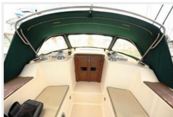
Island Packet 420 Cockpit