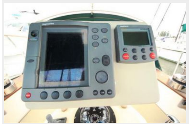
Island Packet 420 Nav Instruments