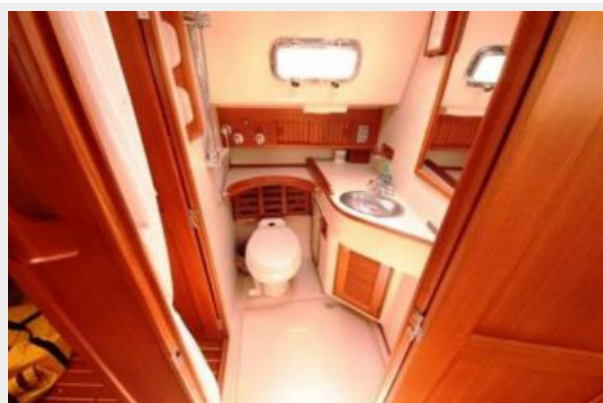
Island Packet 420 Guest Head