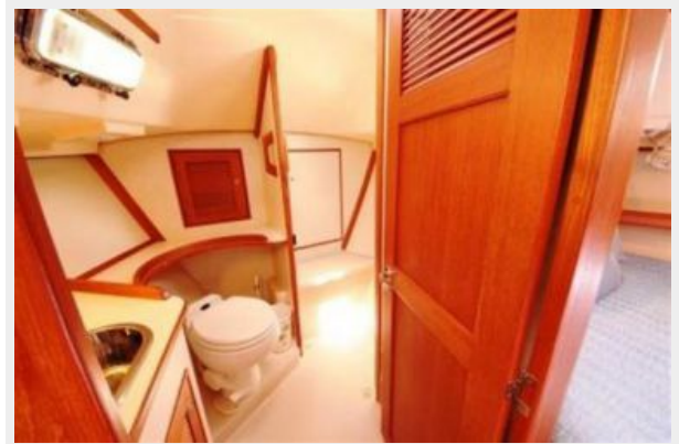
Island Packet 420 Owner's Head w/shower