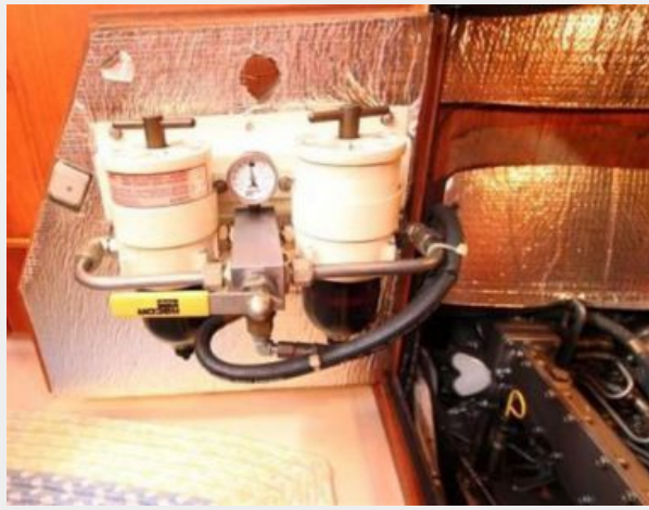
Island Packet 420 Fuel Filters