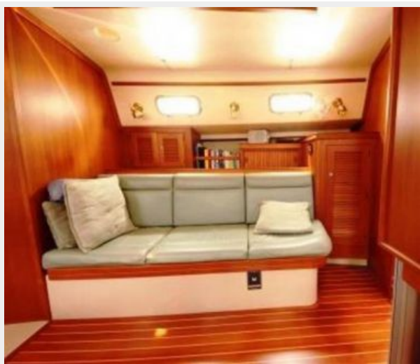
Island Packet 420 Main Salon Port