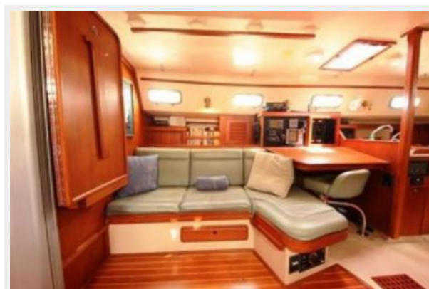
Island Packet 420 Main Salon Starboard