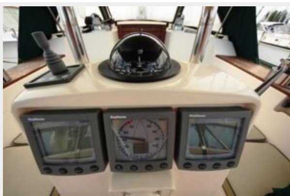
Island Packet 420 NAV Instruments