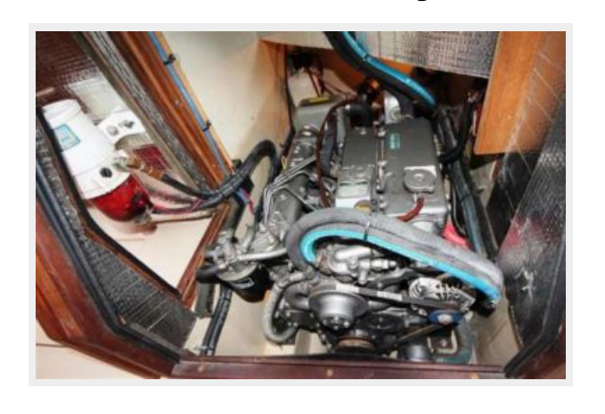
Island Packet 370 Engine