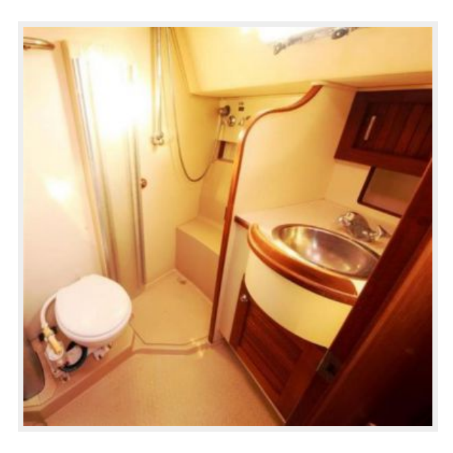
Island Packet 370 Head