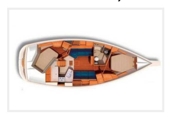
Island Packet 370 Layout