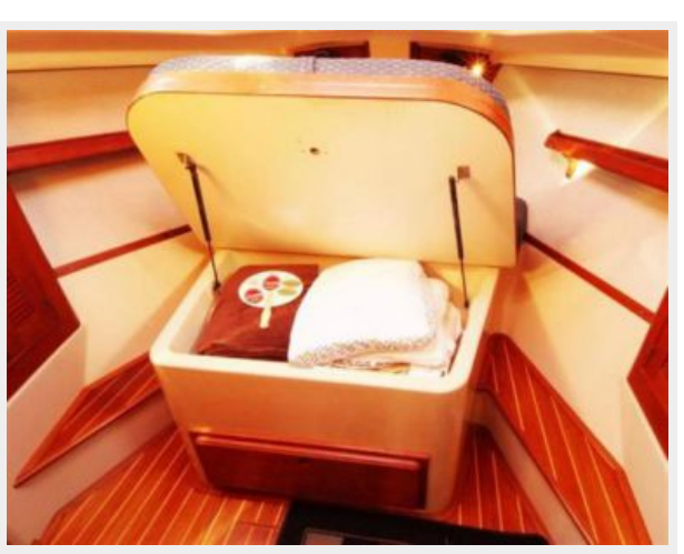
Island Packet 370 under bunk storage