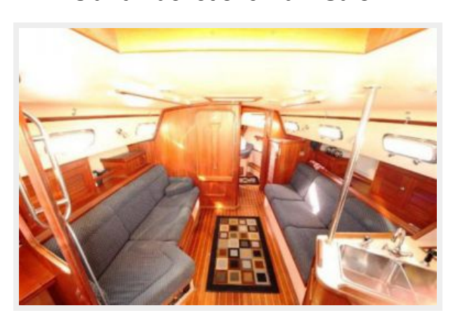
Island Packet 370 Main Salon