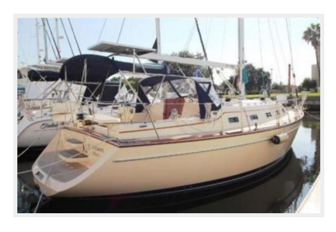
Island Packet 370 Port