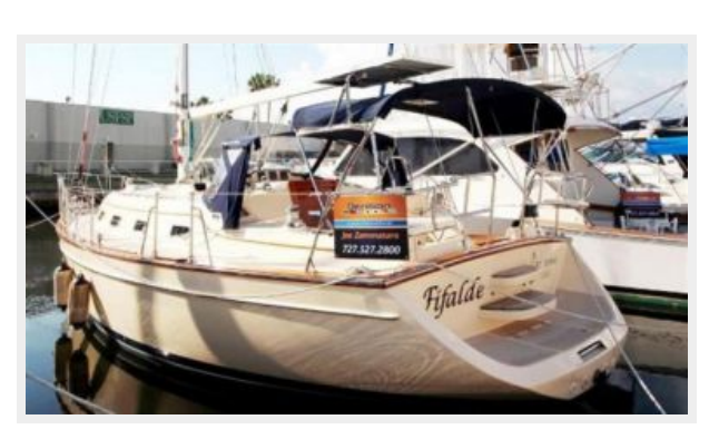
Island Packet 370 Starboard