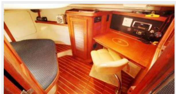
Island Packet 370 Aft Cabin