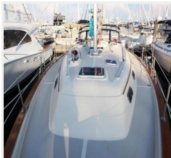
Island Packet 370 Deck