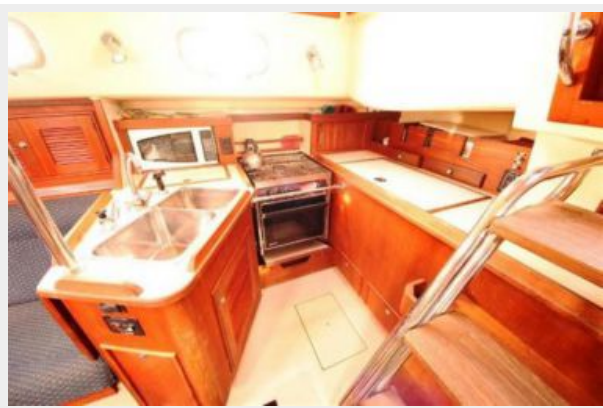
Island Packet 370 Galley