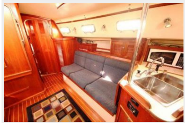
Island Packet 370 Main Salon Starboard