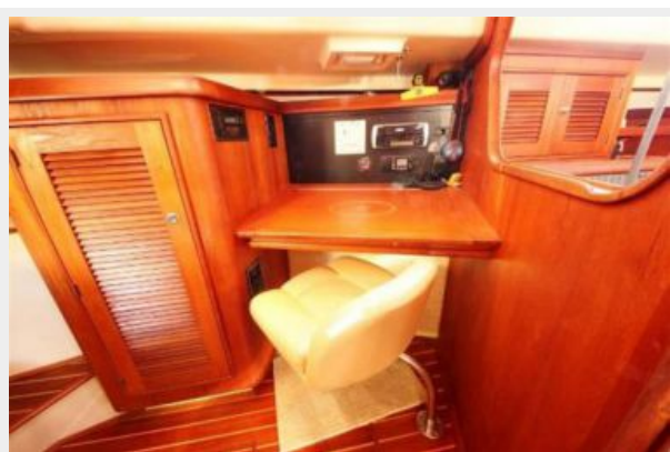
Island Packet 370 Nav Station