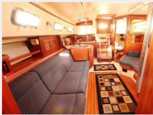
Island Packet 370 Main Salon Aft