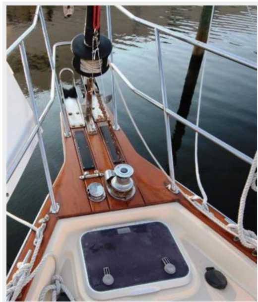
Island Packet 370 Windlass