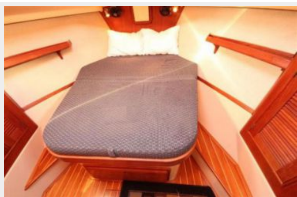
Island Packet 370 Owner's Stateroom