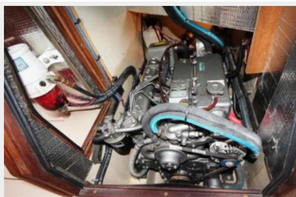
Island Packet 370 Engine