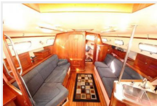
Island Packet 370 Main Salon