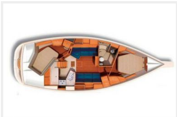
Island Packet 370 Layout