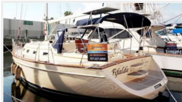
Island Packet 370 Starboard