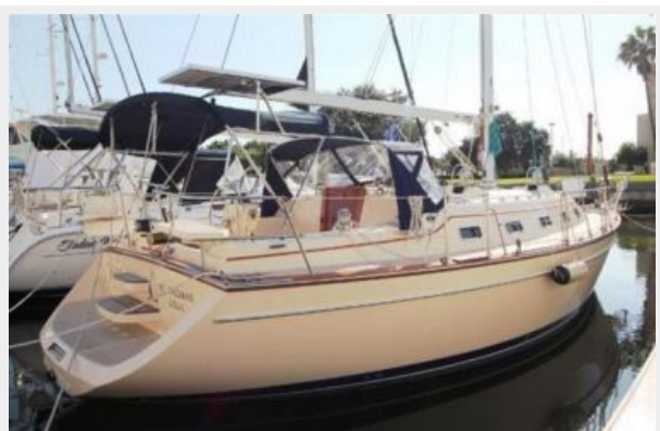
Island Packet 370 Port