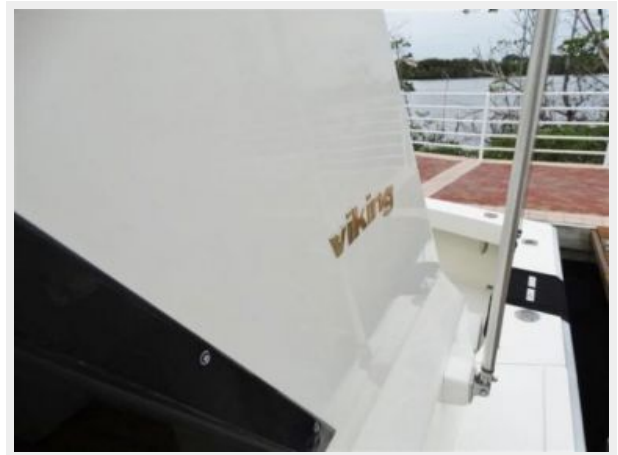
Gold Viking emblem