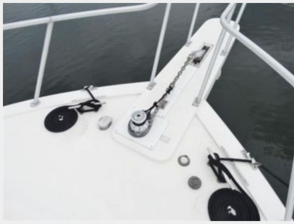
Pulpit and windless