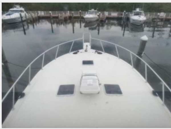
Bow from bridge