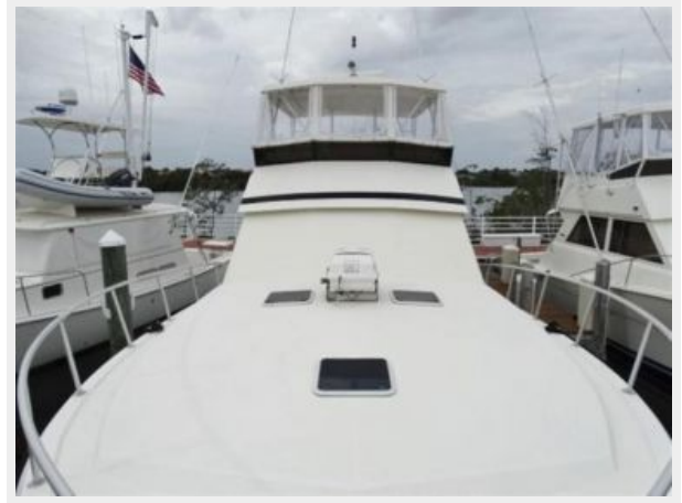
Bow looking aft