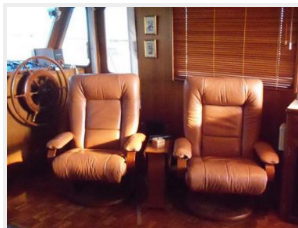
SALON STARBOARD-INSTRUMENT PANEL