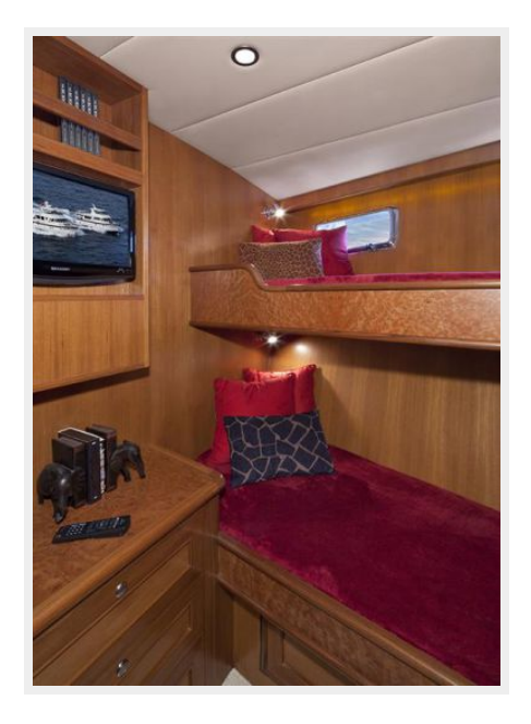
Midship VIP Stateroom