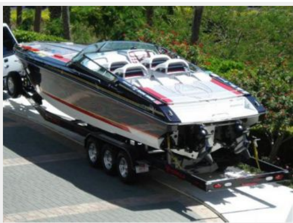
On her trailer