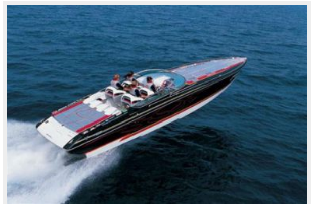
Actual Formula being advertised