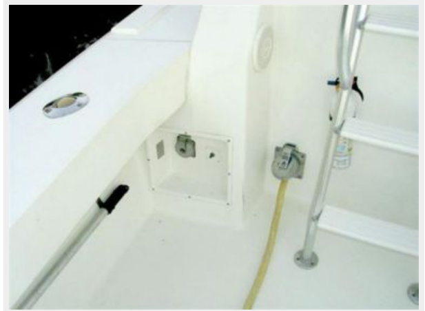
Freezer, Bait Center, Engine Controls and Tackle Drawers Below