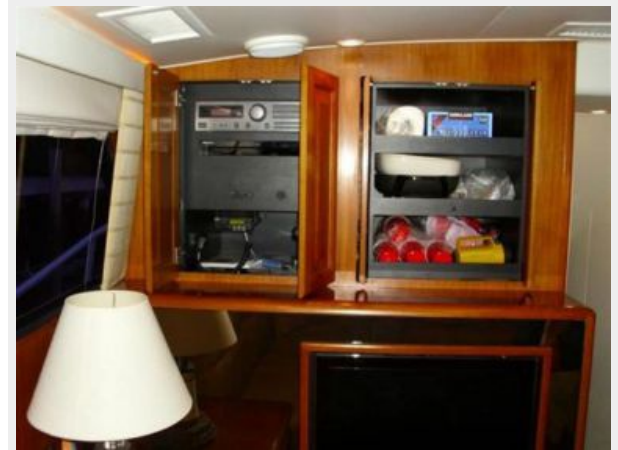
Sound Equipment and Storage