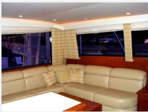
Flybridge Forward Seating and Under Bow Storage