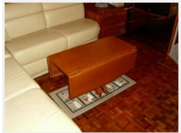
Salon L Shaped Sofa W/Storage