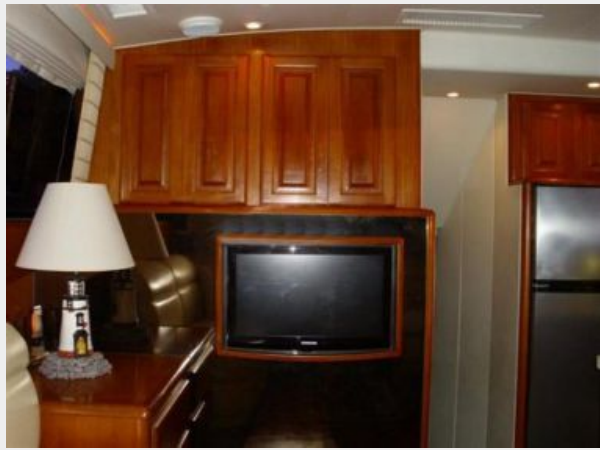
Flat Screen Embedded TV