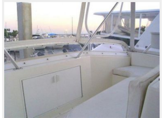
Flybridge Portside Sun Lounge