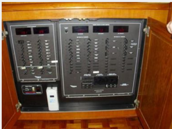
DC and AC Electric Panels