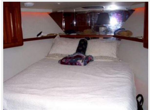
Owners Queen Berth W/Mirrored Head