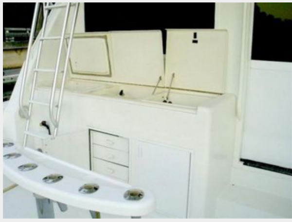
Cockpit Tackle Center Rocket Launcher