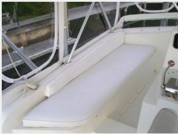
One of Two Overhead Instrument Pod