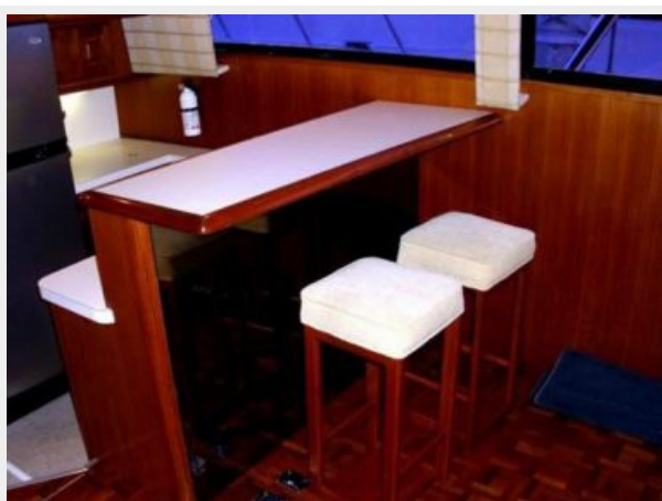
Breakfast Bar W/Two Stools