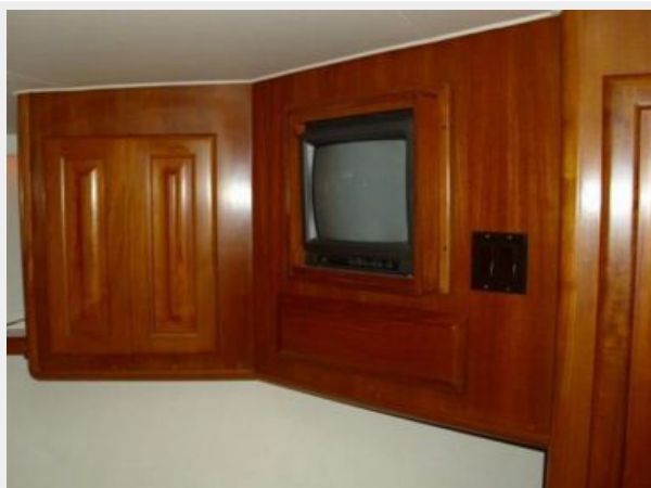
Owner's Stateroom Storage and Entertainment Center