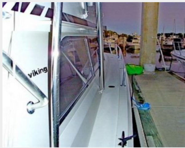
Glenn Denning Cable Recoiler