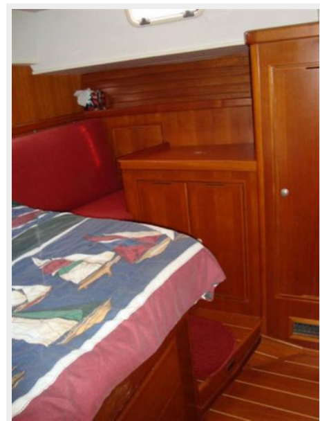
Master stateroom storage