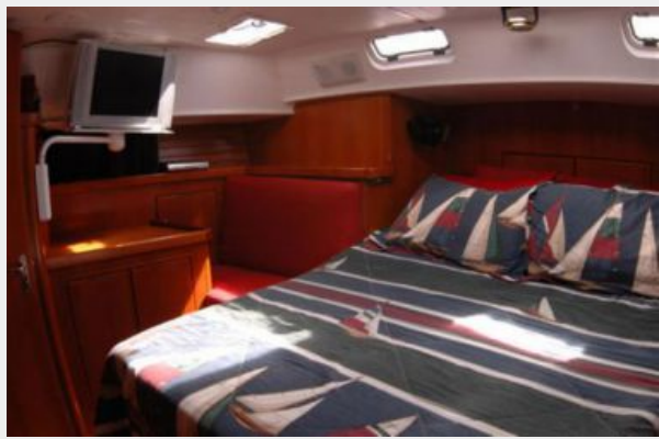
Master Stateroom office