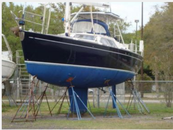
on the hard - view of bottom