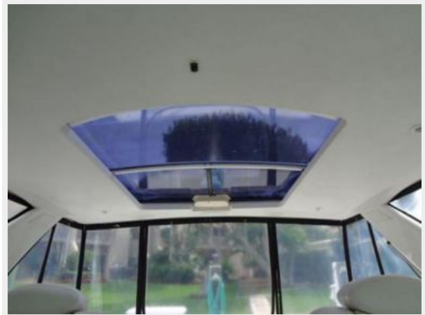
Power sliding sunroof