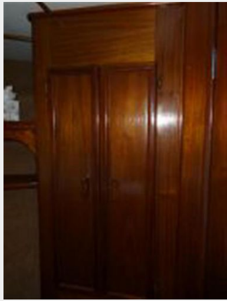
1 of 2 Hanging Locker in Stateroom