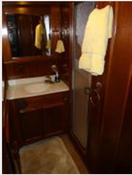
Guest/Day Head with Stall Shower