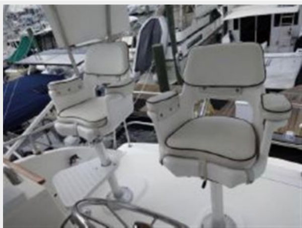
Helm and Companion Seat