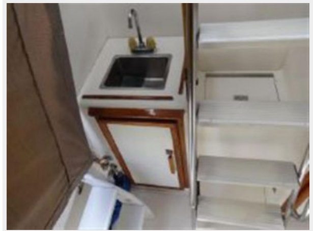
Portside Sink/Tackle Center