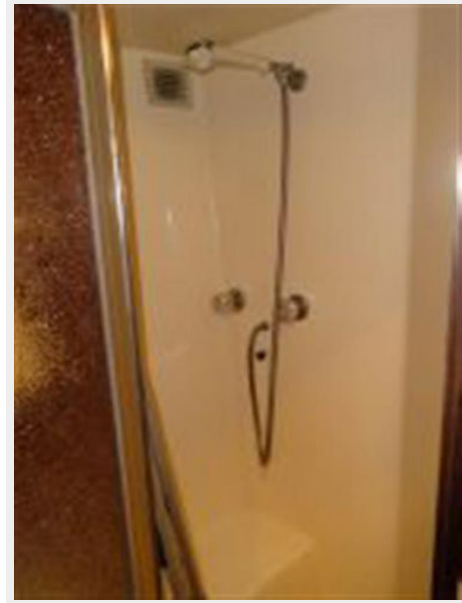
Guest/Day Head Shower