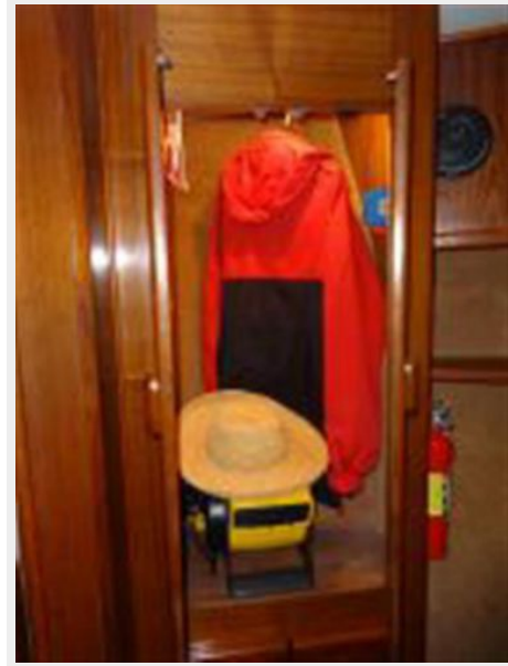
Stateroom Portside Hanging Locker