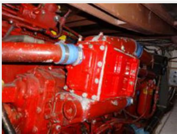
Port Engine Aft