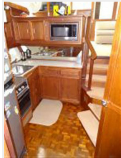
Full Size Galley Refrigerator