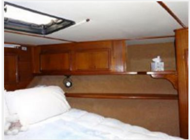
Starboard Stateroom Locker Storage