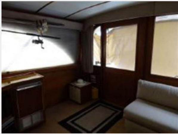
Starboard Salon Looking Aft