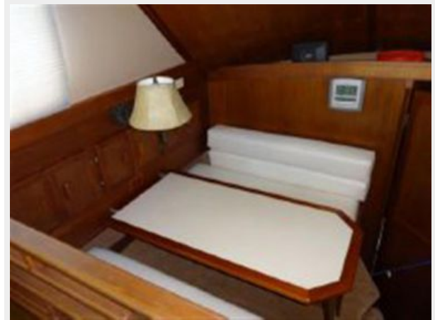
Dinette Down to Port