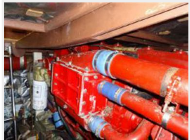
Starboard Engine Looking Aft