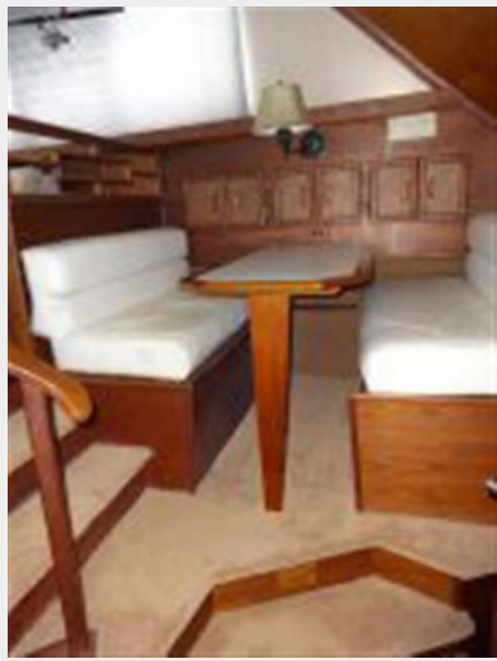
Convertible Dinette Seats 4