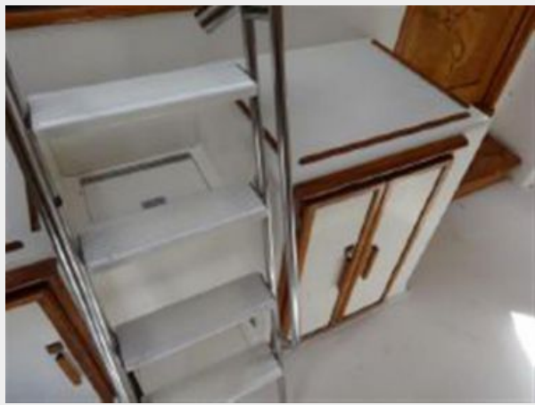
Port Forward Cockpit