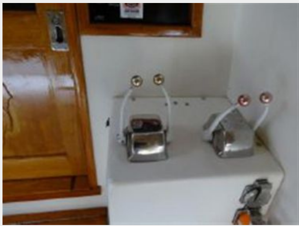
Lower Controls to Starboard