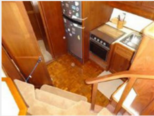
Galley Looking Down from Salon