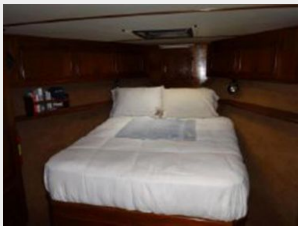
Queen Island Master