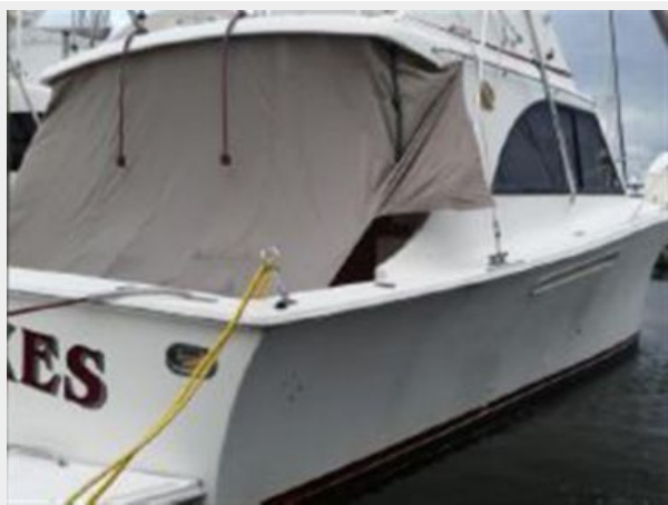
Starboard Aft Hull Profile