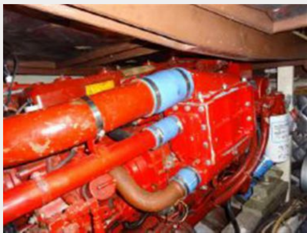
Port Engine Looking Forward