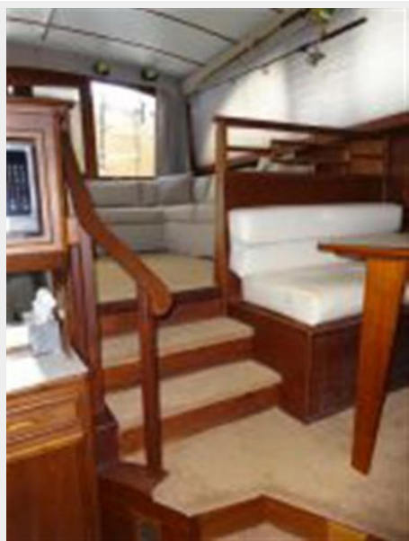
Dinette Wide Open to Salon and Galley