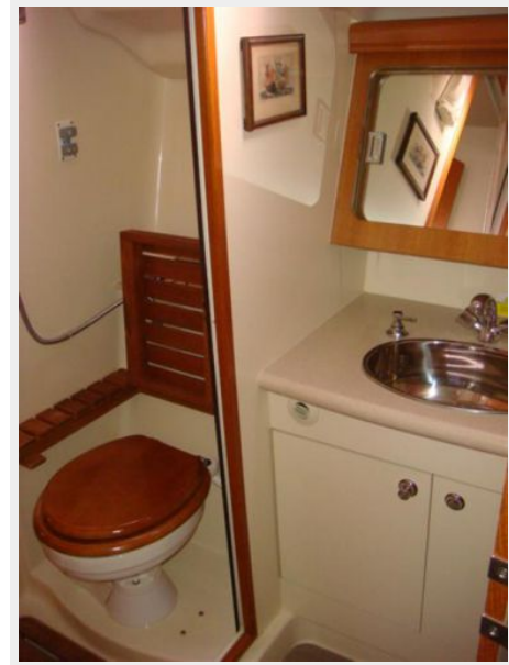
38' Hunter head