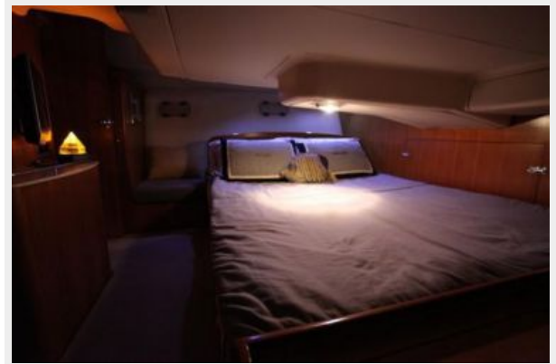
38' Hunter aft stateroom photo1