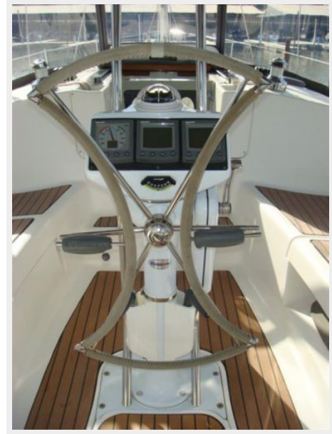
38' Hunter cockpit helm