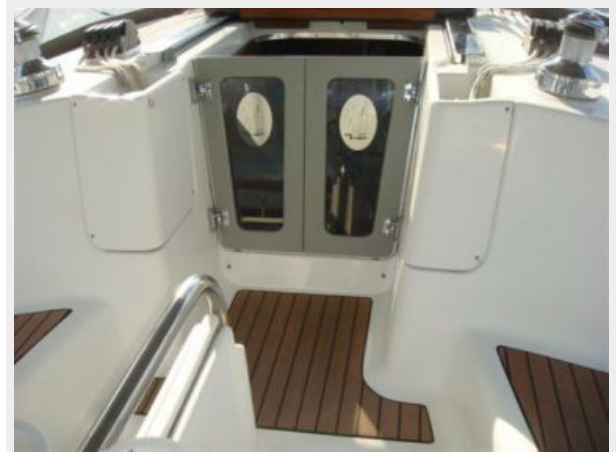
38' Hunter cockpit doors photo1