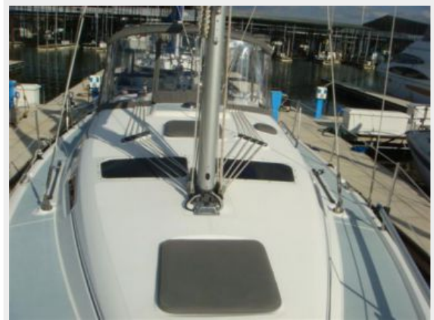
38' Hunter foredeck aft