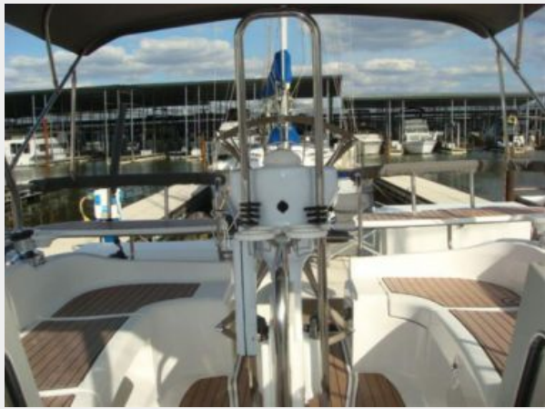
38' Hunter cockpit aft