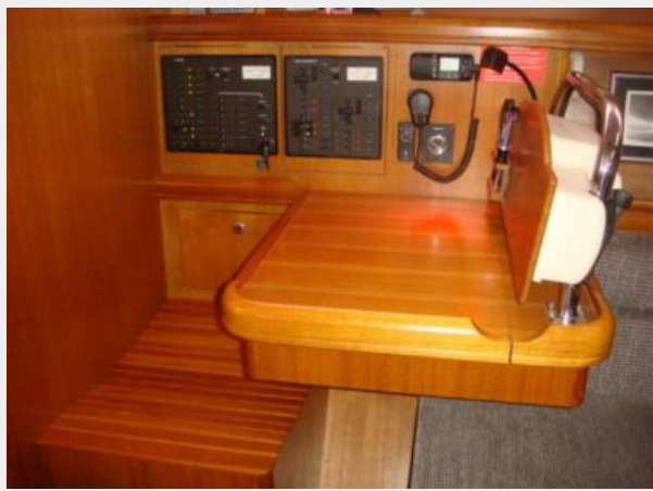
38' Hunter nav station