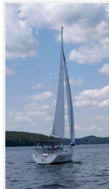
38' Hunter underway starboard aft profile