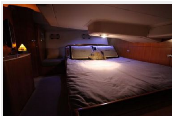
38' Hunter aft stateroom photo3