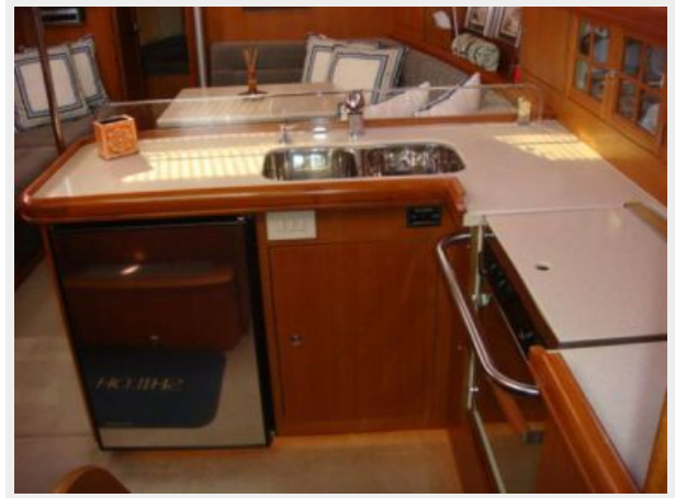
38' Hunter galley photo2