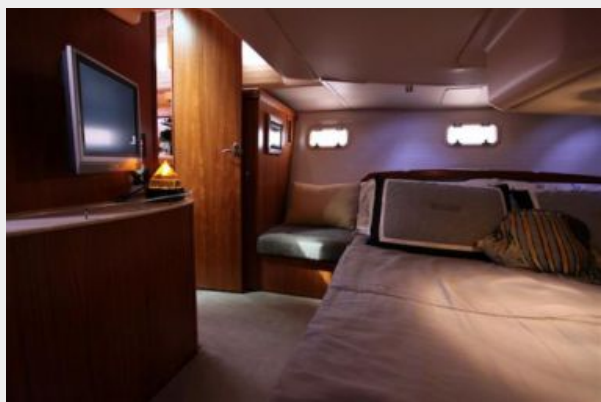
38' Hunter aft stateroom photo2