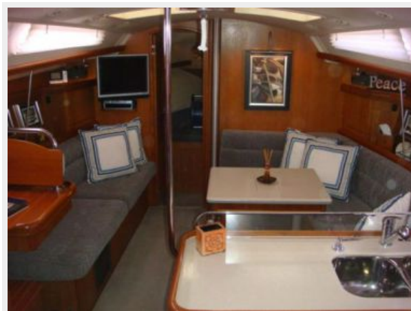
38' Hunter cockpit doors photo2