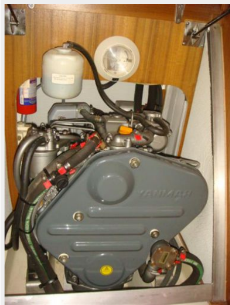
38' Hunter auxilliary