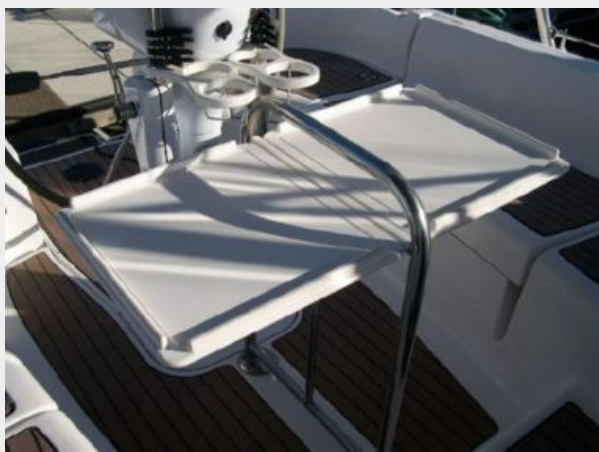
38' Hunter cockpit table