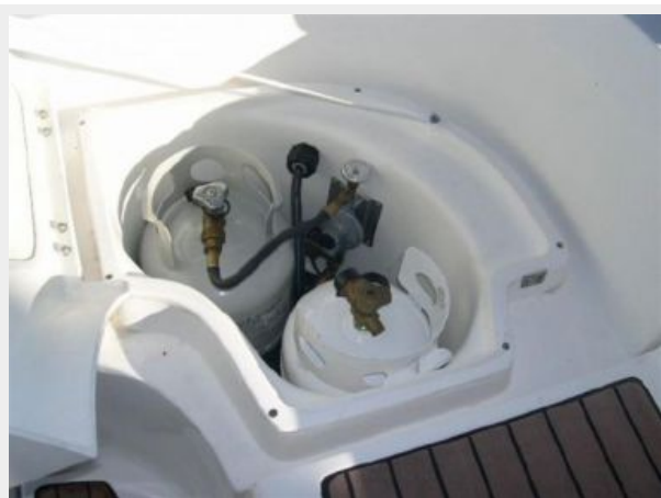
38' Hunter propane locker