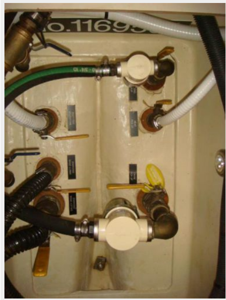
38' Hunter bilge