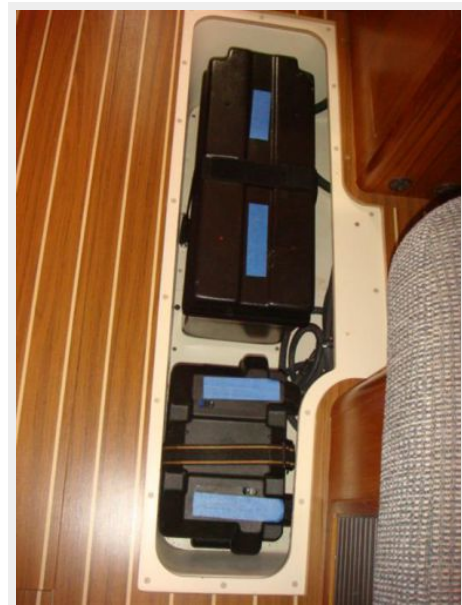
38' Hunter battery bank