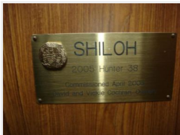
38' Hunter build plaque