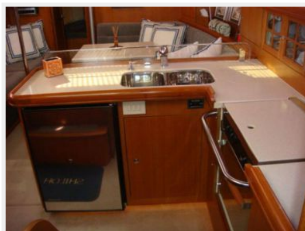
38' Hunter galley photo2