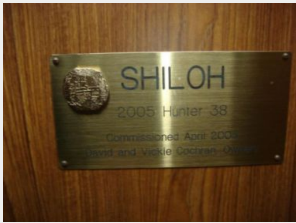
38' Hunter build plaque