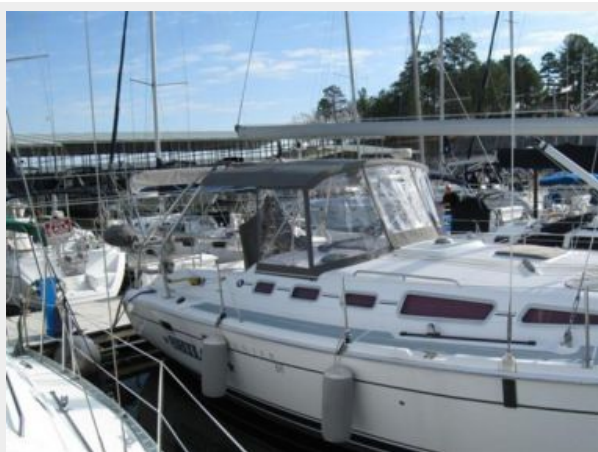
38' Hunter cockpit enclosure