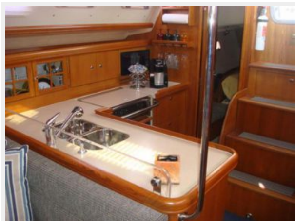
38' Hunter galley photo1