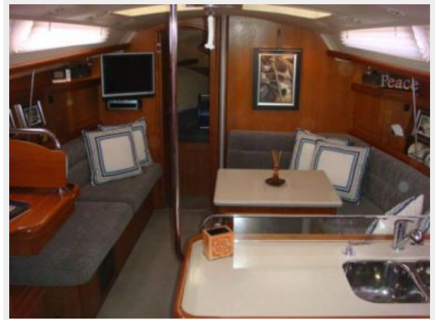
38' Hunter cockpit doors photo2