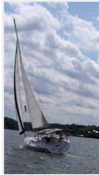
38' Hunter underway starboard aft profile