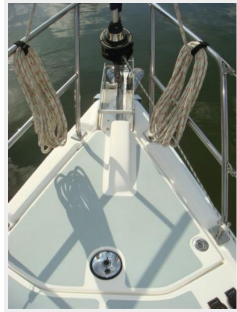
38' Hunter anchor windlass covered