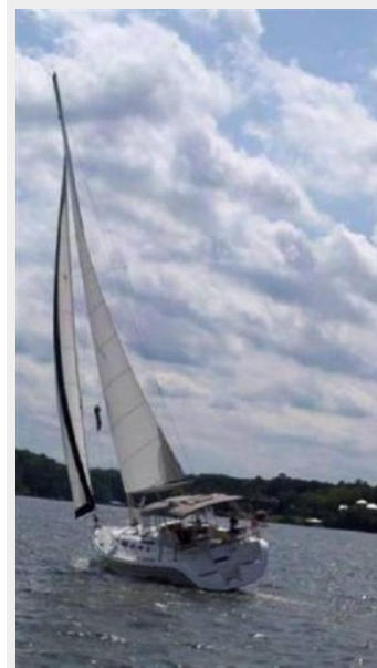
38' Hunter underway aft profile