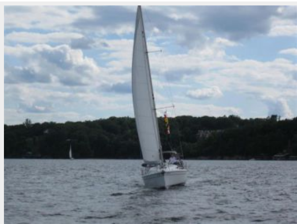
38' Hunter underway forward profile