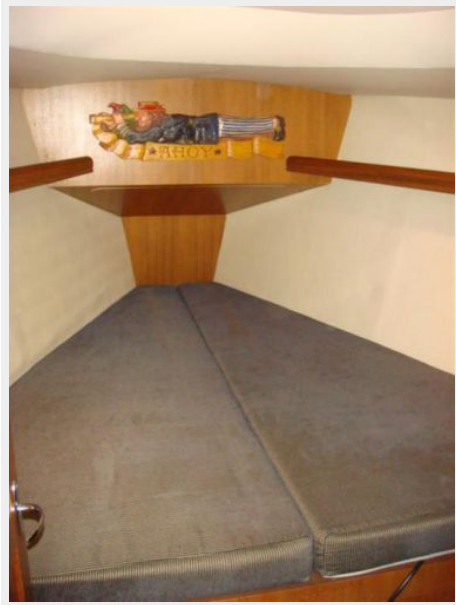
38' Hunter forward stateroom