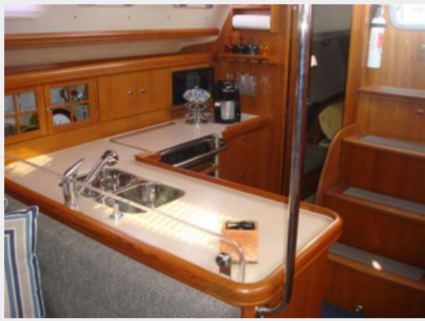
38' Hunter galley photo1