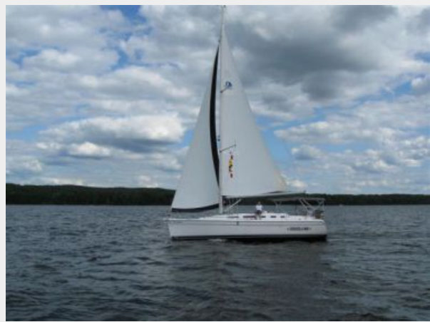
38' Hunter underway port profile