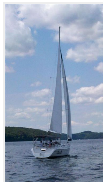
38' Hunter underway starboard aft profile