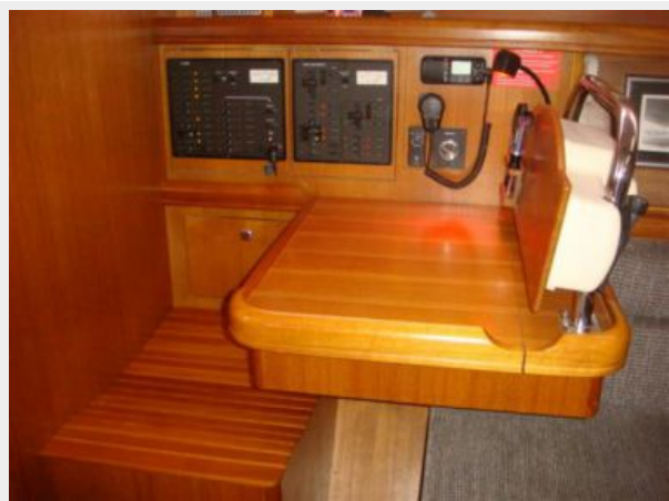
38' Hunter nav station