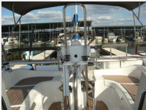
38' Hunter cockpit aft