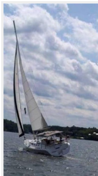
38' Hunter underway starboard aft profile