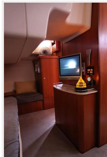
38' Hunter aft stateroom photo3