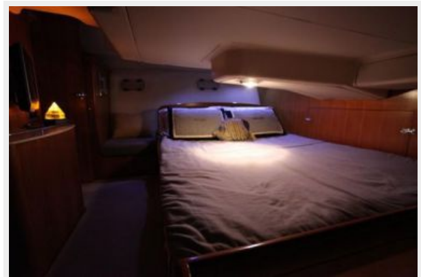
38' Hunter aft stateroom photo3