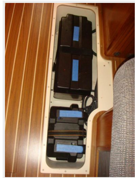
38' Hunter battery bank