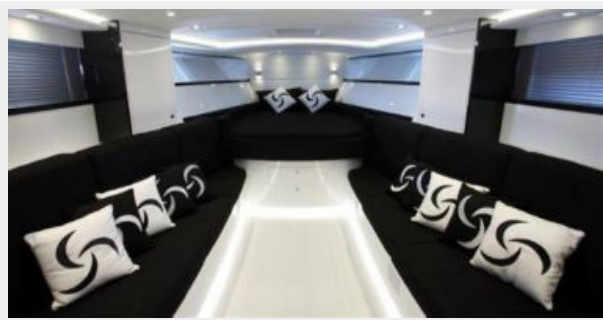
Otam 45 facing forward