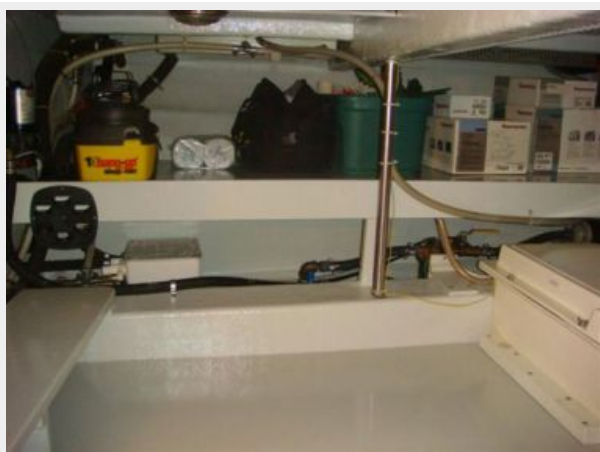
43' Mikelson mid bilge storage compartment starboard