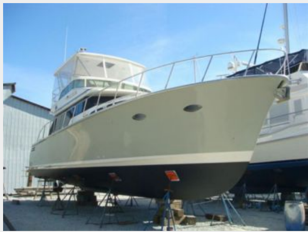
43' Mikelson hauled out photo1