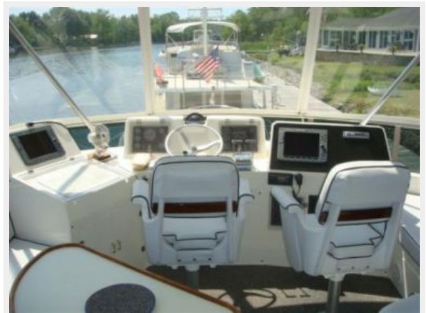
43' Mikelson flybridge forward