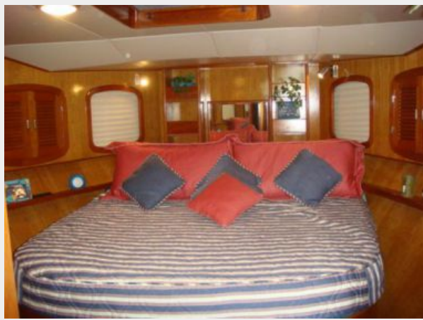
43' Mikelson master stateroom