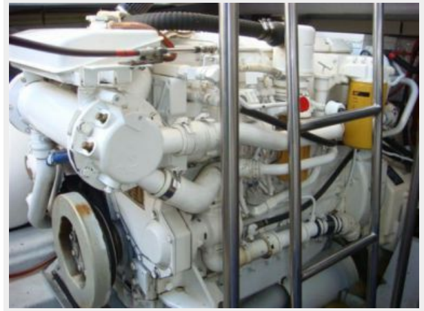
43' Mikelson port main engine