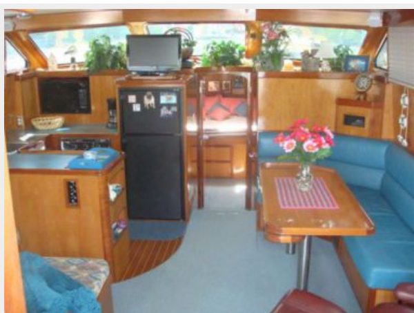
43' Mikelson salon forward