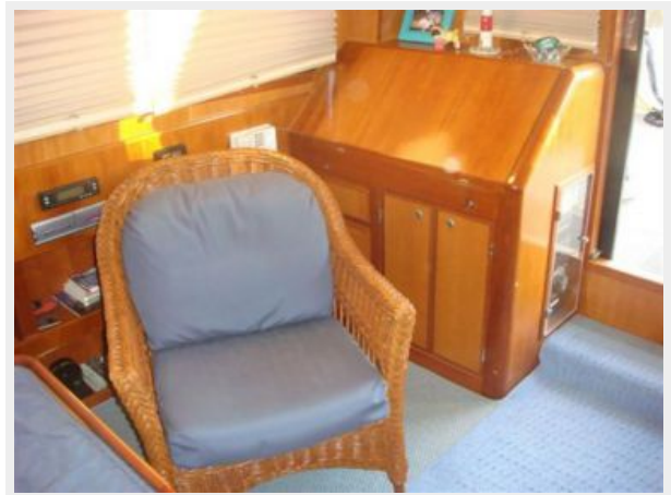
43' Mikelson salon starboard aft photo2