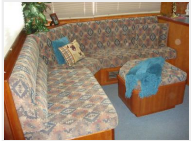
43' Mikelson salon port seating photo2