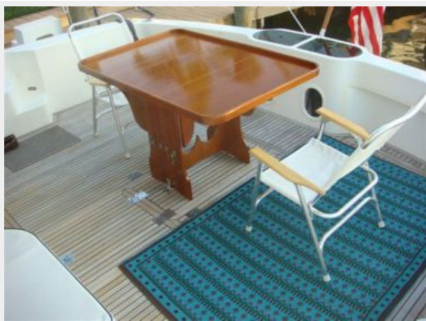
43' Mikelson cockpit photo2