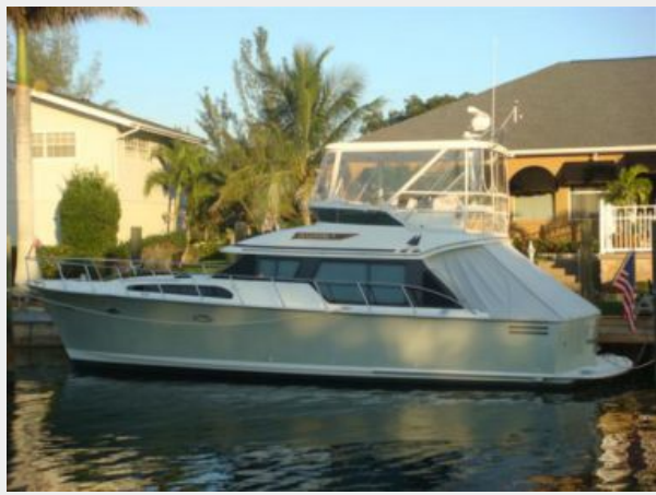
43' Mikelson port profile photo2