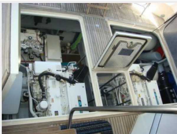
43' Mikelson engine compartment access