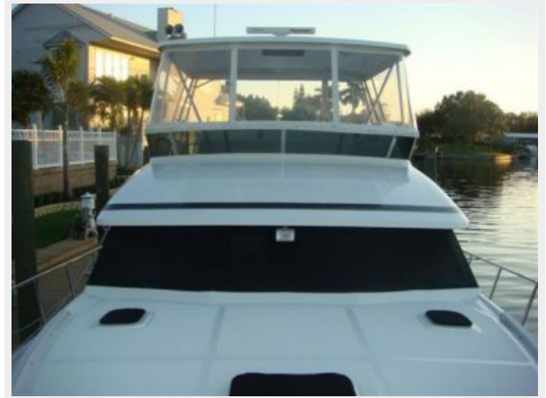
43' Mikelson foredeck aft