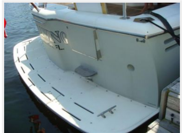
43' Mikelson swimplatform