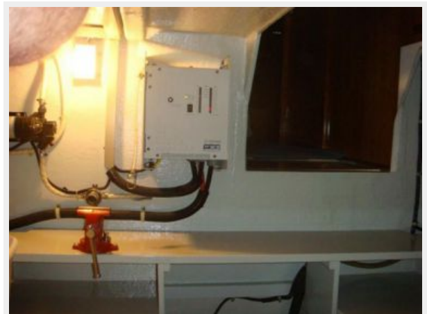
43' Mikelson mid bilge storage compartment forward