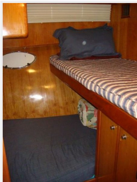
43' Mikelson guest stateroom