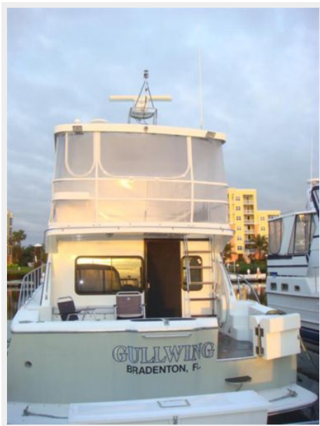
43' Mikelson aft profile