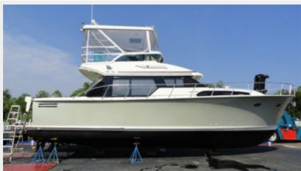
43' Mikelson hauled out photo3