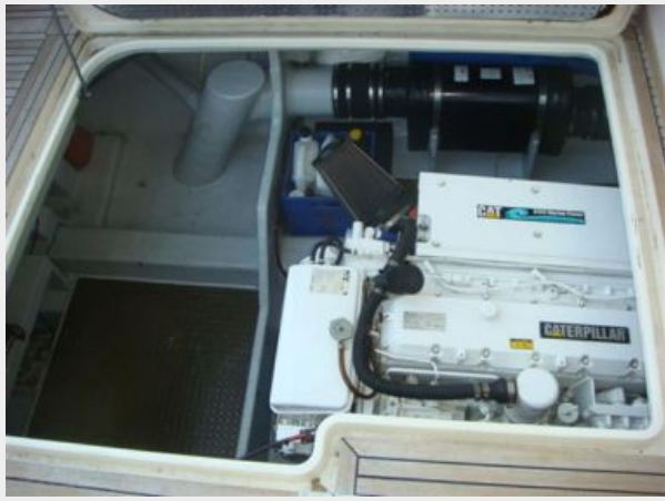
43' Mikelson port engine compartment