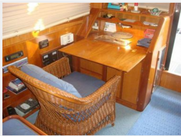
43' Mikelson salon starboard aft photo1