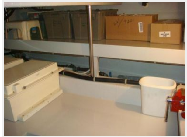
43' Mikelson mid bilge storage compartment port