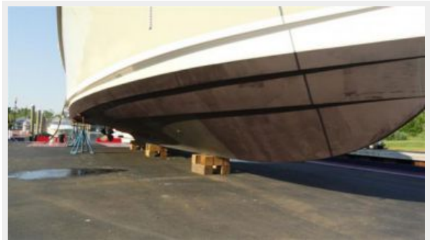
43' Mikelson hauled out photo4