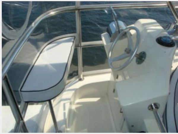
43' Mikelson flybridge aft station