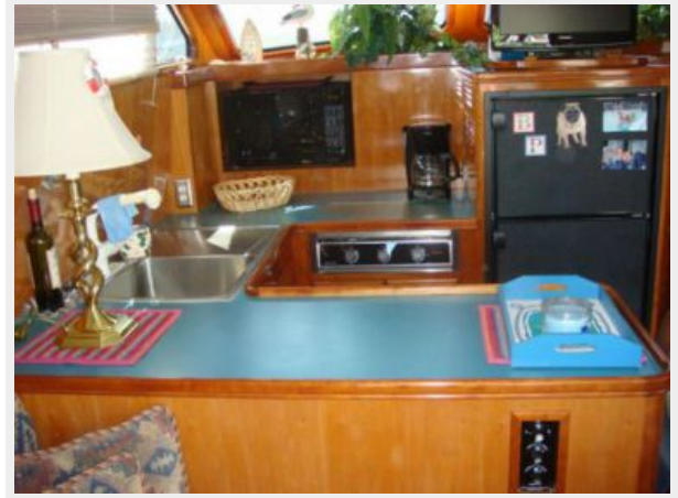
43' Mikelson galley photo2