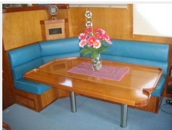
43' Mikelson salon dinette photo1