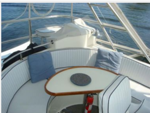
43' Mikelson flybridge aft