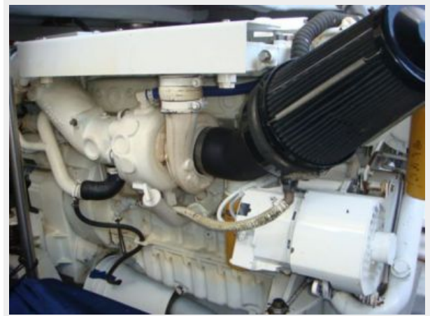
43' Mikelson starboard main engine