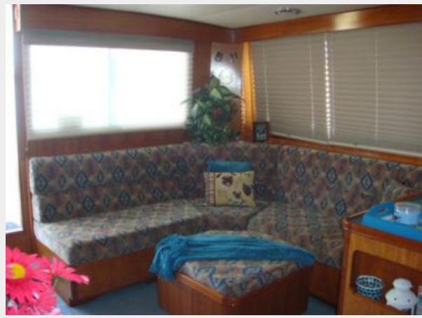
43' Mikelson salon port seating photo1