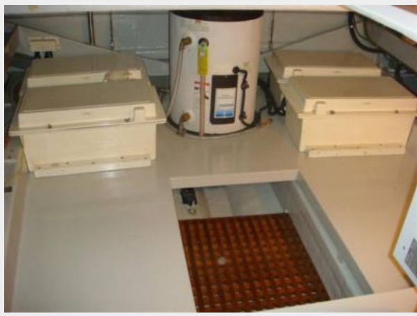
43' Mikelson mid bilge storage compartment