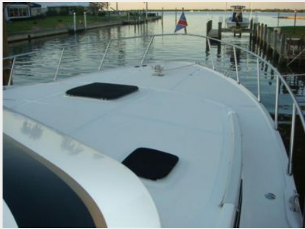
43' Mikelson foredeck