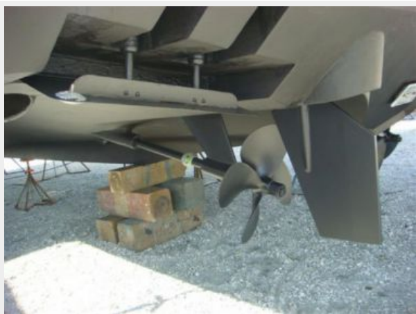
43' Mikelson port running gear