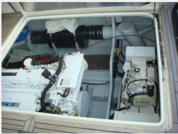
43' Mikelson starboard engine compartment