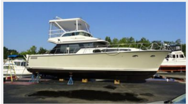
43' Mikelson hauled out photo2