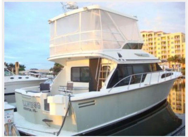
43' Mikelson starboard aft profile