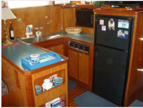
43' Mikelson galley photo1