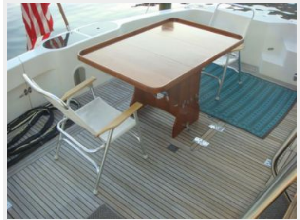
43' Mikelson cockpit photo1