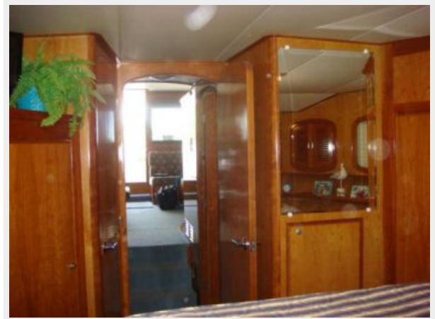
43' Mikelson master stateroom forward