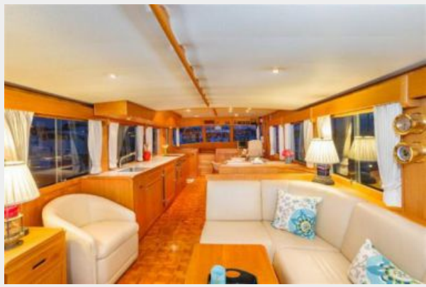
Saloon looking forward