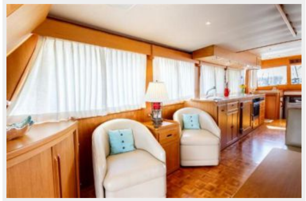
Saloon looking forward to port