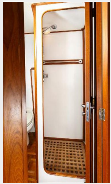
Master Stateroom- Shower