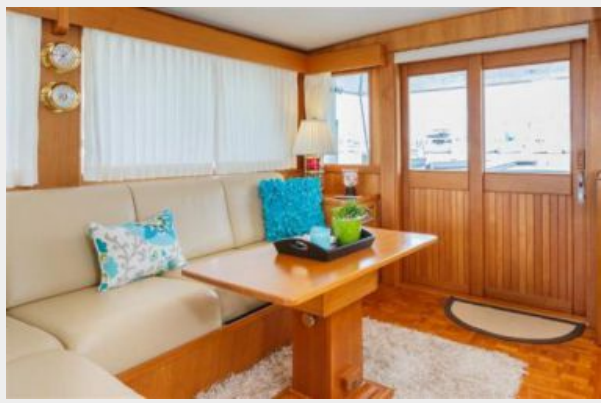
Saloon looking aft to starboard