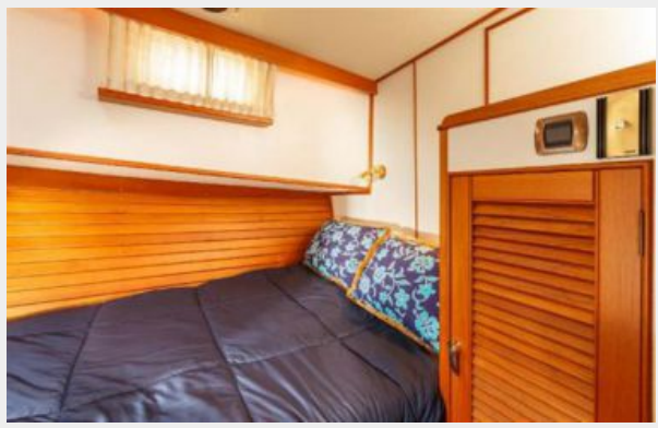
VIP Stateroom #1