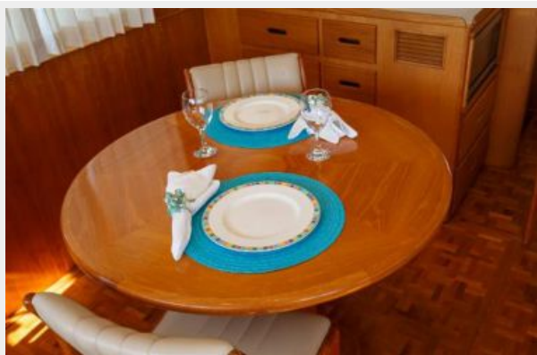
Dining area looking aft