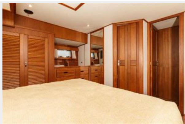
Master Stateroom lookin forward to port