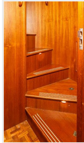
Curved stairs running aft to Master