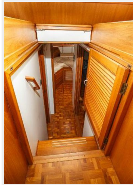
Vee Berth- Looking aft to starboard