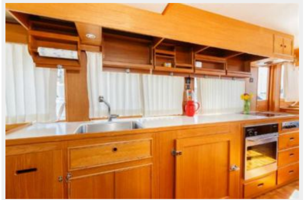
Galley with drop down storage