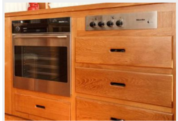
Miele oven and controls for cooktop