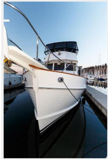
Port side looking aft