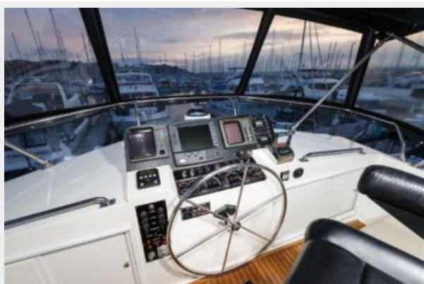
Flybridge helm station