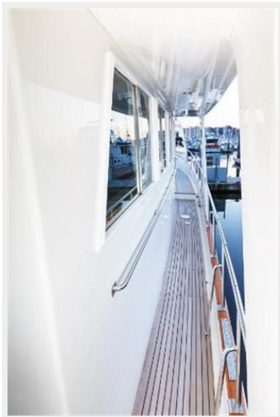
Starboard side deck