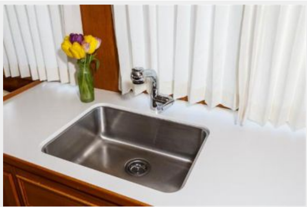
Galley stainless steel sink