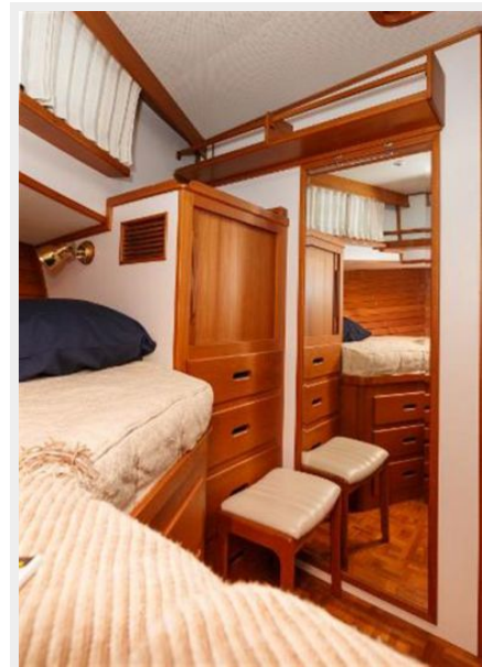
Vee Berth- Looking aft to starboard