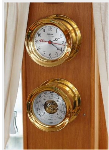
Chelsea clock and barometer