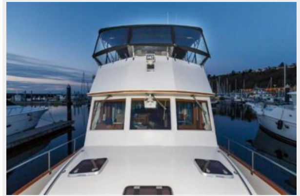
Bow looking aft