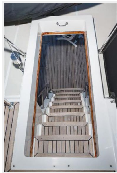
Boat deck coming up from cockpit