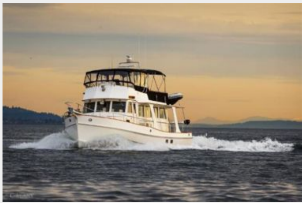
Grand Banks 52 Europa- Starboard