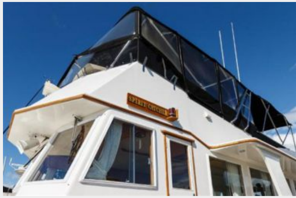
port side deck