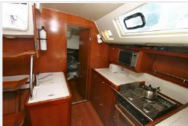
Door to port aft stateroom