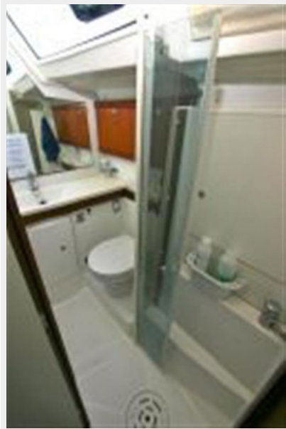
Aft head from stbd. aft stateroom