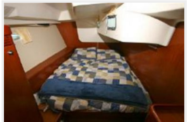
Stbd. aft stateroom