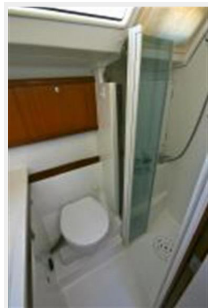
Aft head from salon