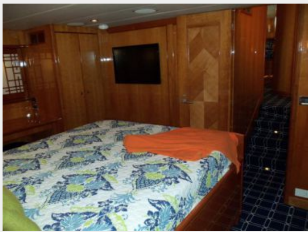
Master Looking Forward