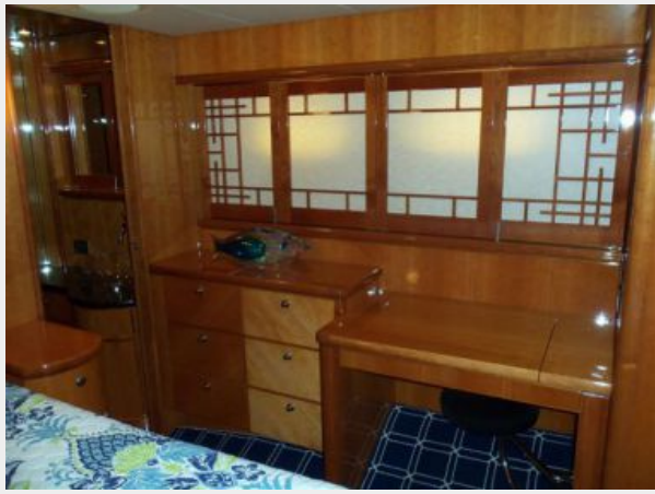
Master to Port