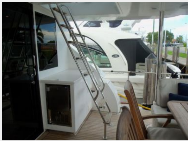
Aft Deck Flybridge Ladder