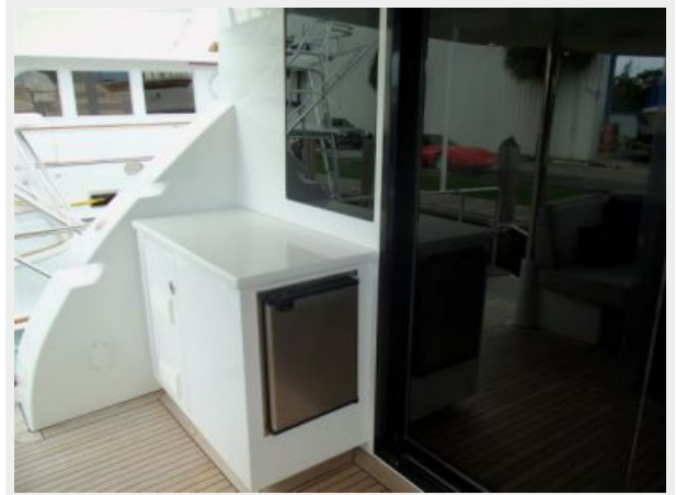
Aft Deck to Port