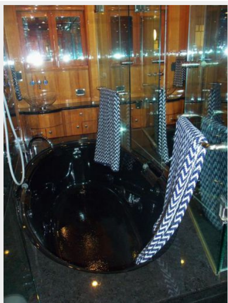
Centerline Master Shower