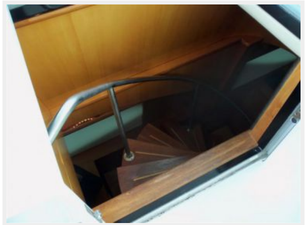
Flybridge Interior Access