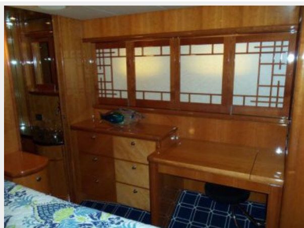
Master to Port