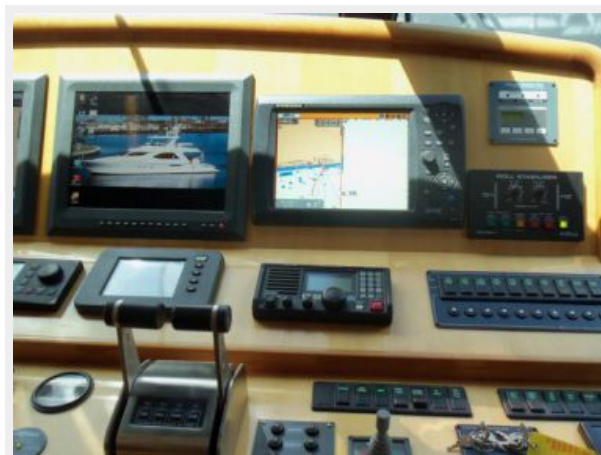
Pilothouse Generator Gauges