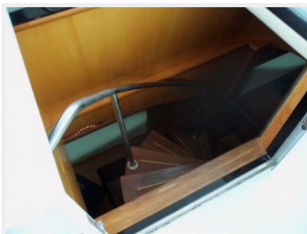
Flybridge Interior Access