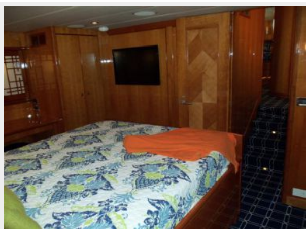
Master Looking Forward