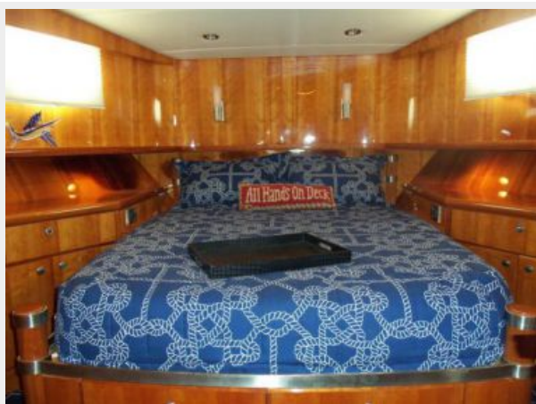
VIP Looking Forward