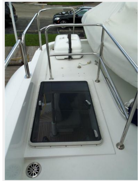
Boat Deck Access