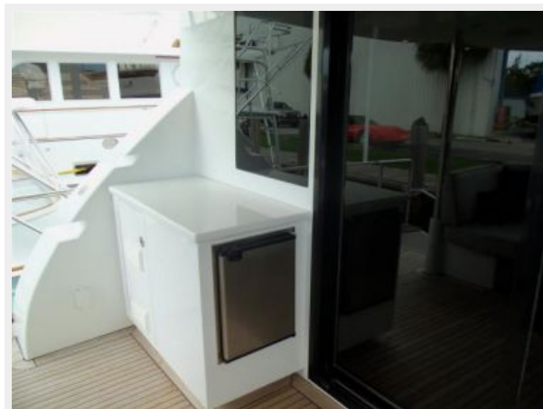
Aft Deck to Port