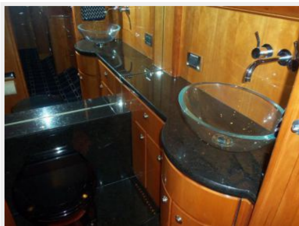
Portside Master Head