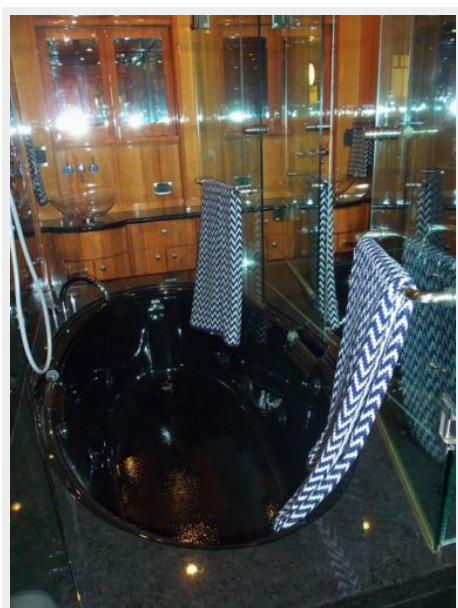
Centerline Master Shower