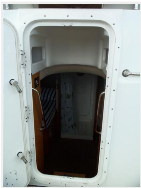
Engine Room Watertight Door