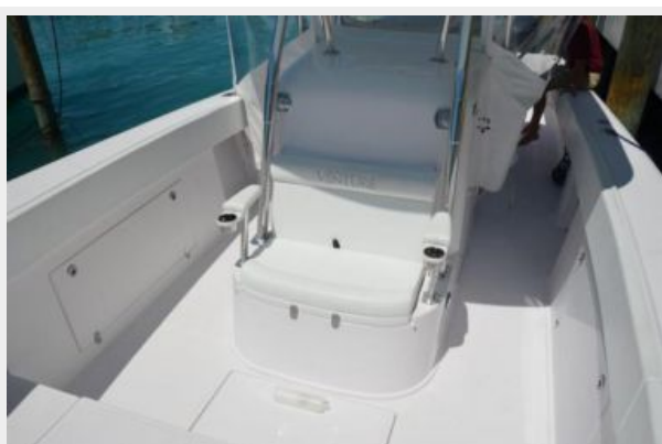
Forward Console Seat