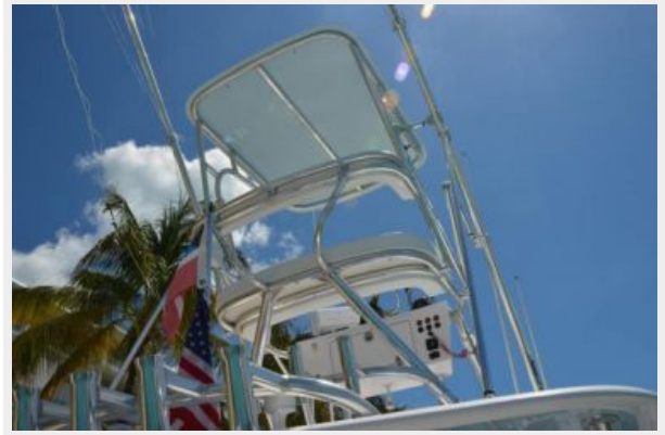
Fiberglass Buggy Top