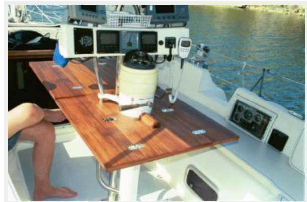
Custom Cockpit Table with seating for 6 people