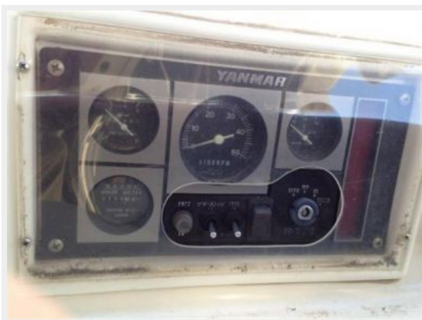
Engine Instrument Panel in Cockpit