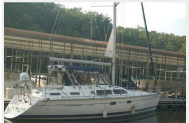
Stern Profile - Starboard