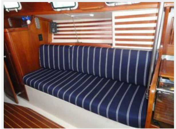
Starboard Bench Seating