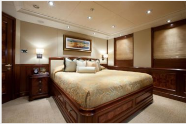
Guest Double - 2