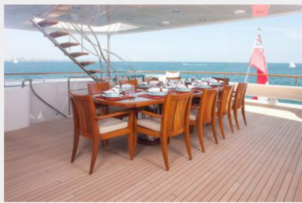
Upper Aft Deck Dining