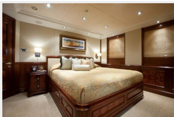
Guest Double - 2