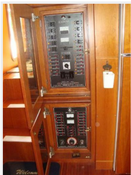
Main Electrical panels