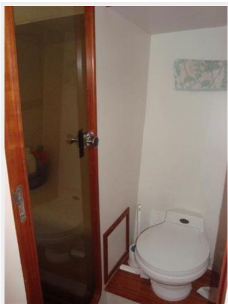
Guest/Day head w/stall shower