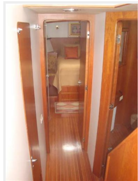
Hallway to Master Stateroom