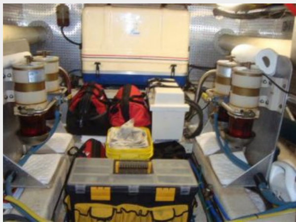
Generator in Sound Shield