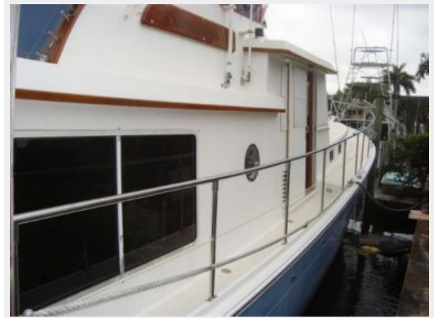
Side deck - w /HIGH RAILING