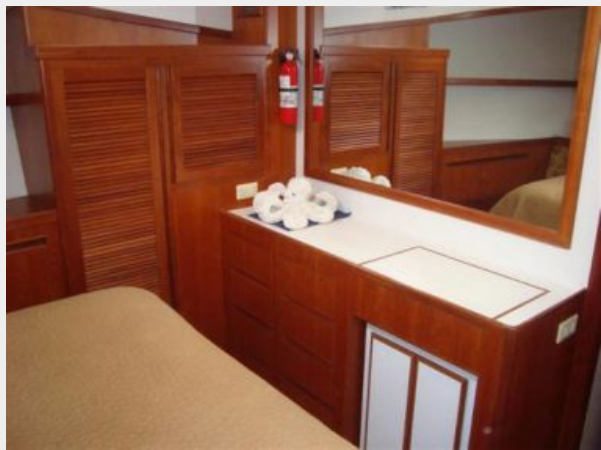
Master - Aft storage