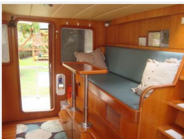
Pilot Berth - Converts to a double berth_