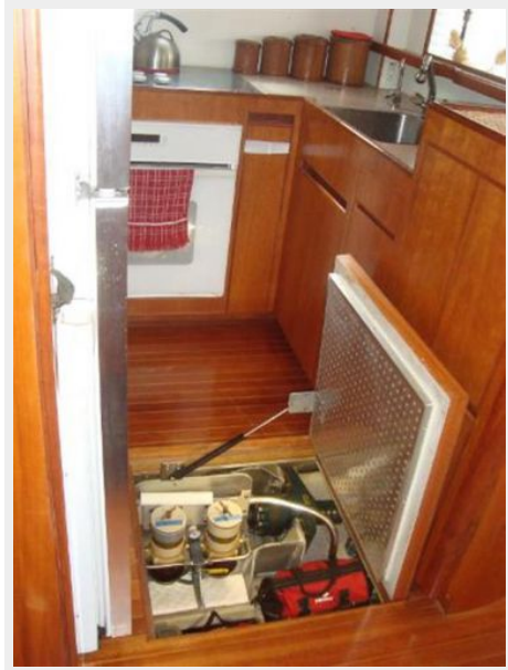
Open Hatch to Engine room - Galley