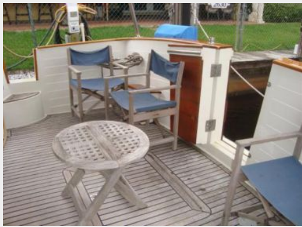
Aft Cockpit - access to swim platform