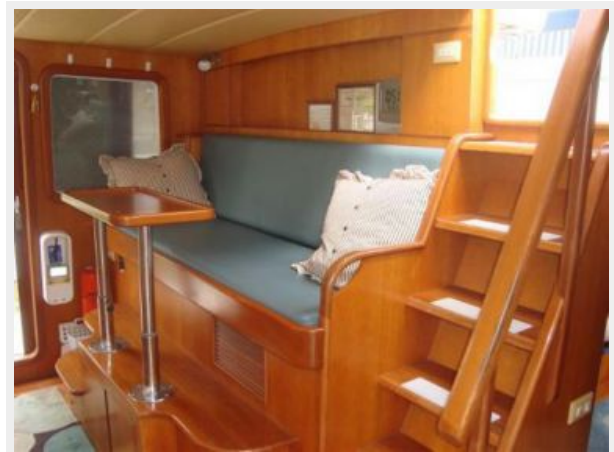
Pilot Berth- Stairway to Flybridge